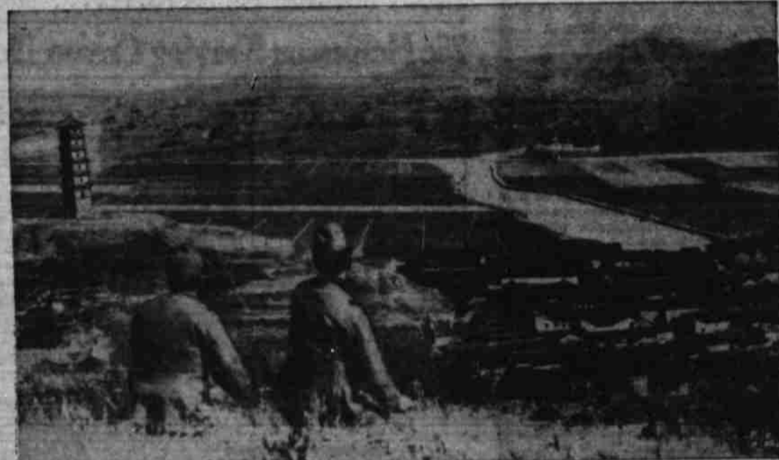
IN FERTILE CHINESE LAND being eyed by Jap soldiers from a hill at Soochow not far from Shanghai is an eloquent summary of Japan's motives in the conquest of China.