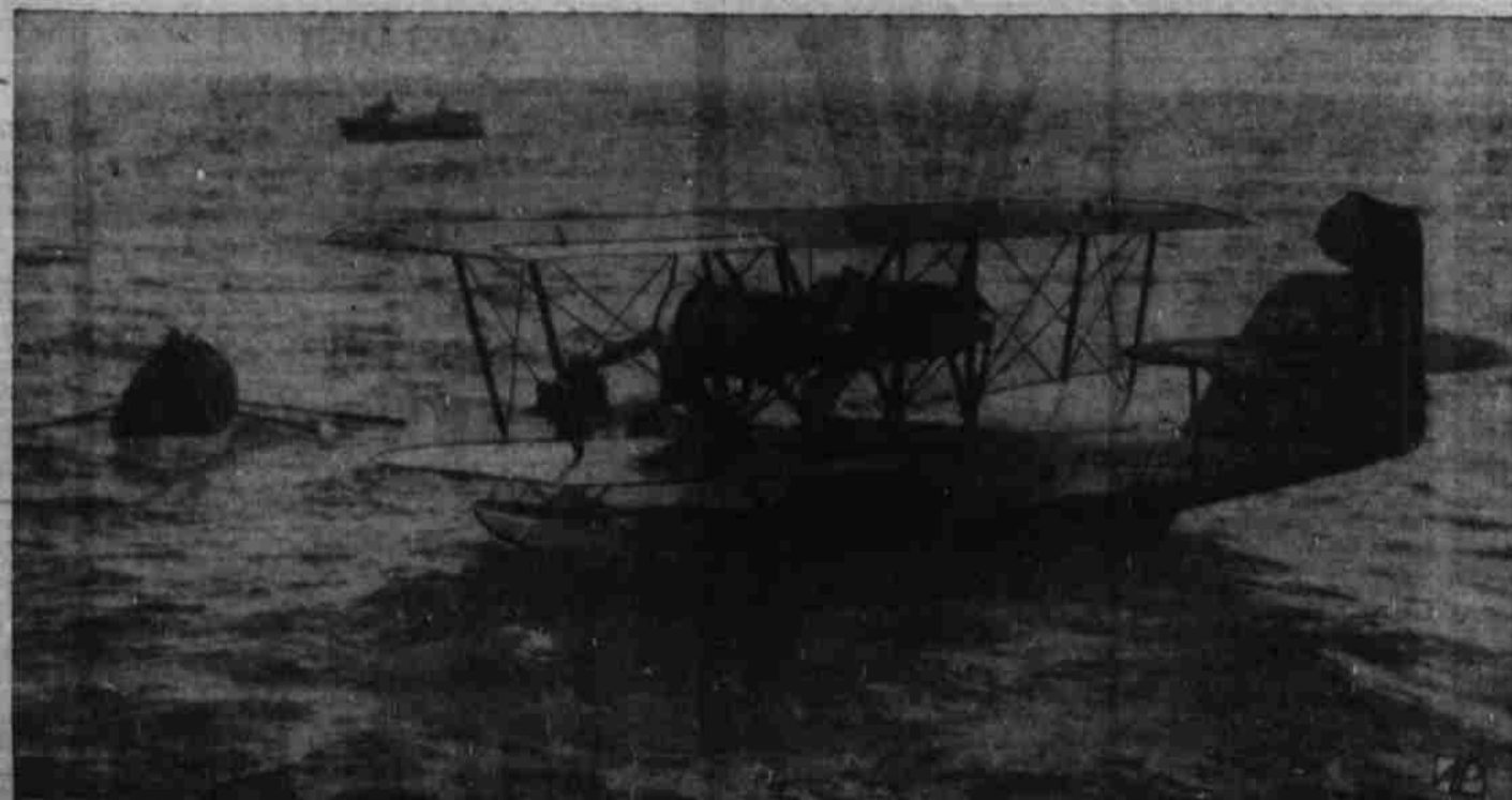
IT WAS JUST A REHEARSAL 'RESCUE' when the "Hull Boat," latest addition to the U. S. coast guard at Cape May was given a rough water test off the Jersey coast. With a full crew of four aboard, the amphibian landed in rough sea, took an "injured" man from surf boat (left) and placed him in one of stony's four berths.