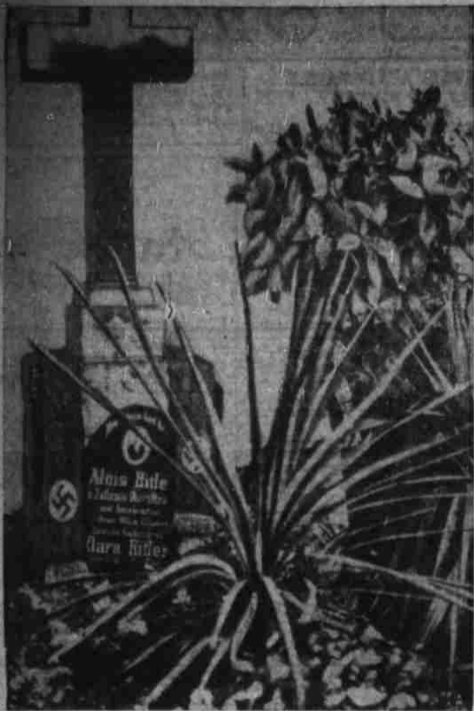
TO TWO BURIED HERE was born a son, Adolf Hitler, who paused grim-faced at this Leonding, Austria, grave while on his triumphant way to Vienna where the fusion of Austria into the German Reich was celebrated. German planes droned overhead as Der Fuehrer stood at grave.