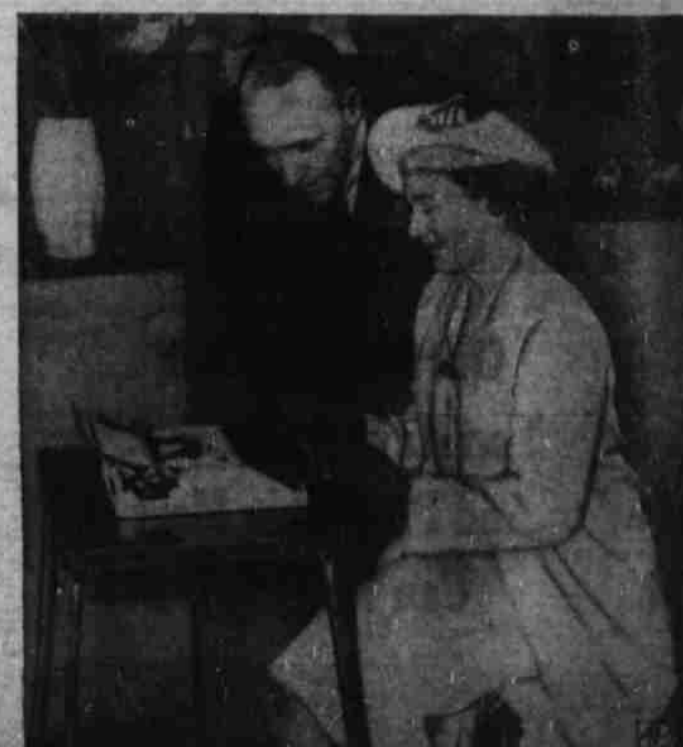
'TYPIST WANTED' doesn't apply here. She's the Duchess of Gloucester who, visiting the British Industries Fair in London, tried out "world's smallest typewriter."