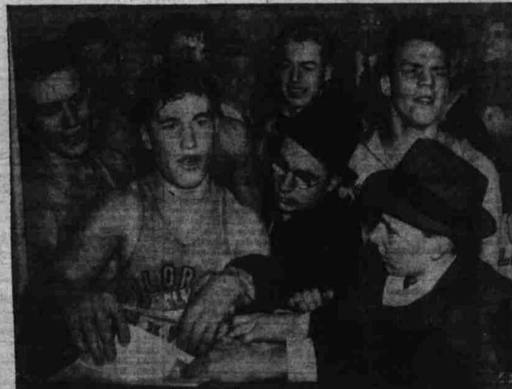
HERO-WORSHIPPING NEW YORKERS swarmed around Byron "Whizzer" White begging autographs from the All-American football star, Phi Beta Kappa and Rhodes scholar who played in the Colorado-New York University basketball game won 48 to 47 by Colorado. White has been offered $15,000 to play professional football with a Pittsburgh team and is reported undecided about the offer. As a Rhodes scholar he's scheduled to go to England for study.