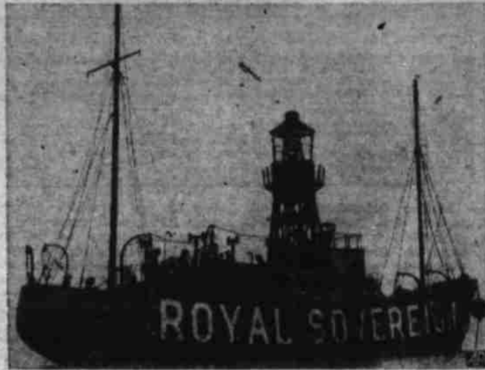
SO THAT LIGHT WON'T FAIL, reflectors installed on Britain's new lightship, the Royal Sovereign, got final inspection before ship left for shoals off Eastbourne. New steel ship provides more luxurious accommodations for crew.