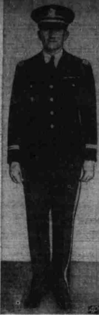
RETREAT OF KHAKI is sounded by adoption of a new blue dress uniform for the army, to cost $100. New suits have dark blue caps, sky blue trousers with gold stripe, dark blue single-breasted coats. Black belt will be worn.