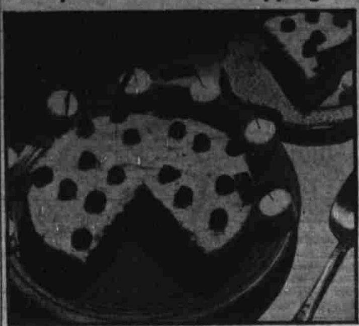
A layer of cake topped with a jelled cherry mixture, molded and snow-capped with the aid of marshmallows, creates this timely Washington pie. American flags in marshmallow standards complete the picture.

If the name "Washington Pie" has ever been copyrighted, we're responsible for infringement. But what are you going to do when you've concocted a dessert that is so much like a Washington Pie should be—with cherries and stars and stripes—but give it the right name and hope for the best? But then, perhaps we shouldn't make such an issue of naming this individual. What most of us are really interested in is just how one makes this three-layered February fantasy consisting of a layer of cake and a layer of jelled cherries, topped off with a fluffy, white, whipped cream-like mass. First of all, you bake a layer of your very best white cake. This is the foundation of the dessert. Then you make up a layer of the jelled cherry mixture (recipe given below) in the same size cake tin, and lo and behold when it's "set" you have not only a layer of clear jelled cherries but a top layer of fluff and foam, as well. This is then placed atop the cake, decorated with cherries and served up from a plate edged with tiny American flags in marshmallow standards. Clever? Yes, and it's "specialicious" too!