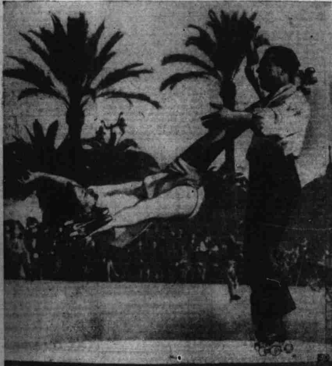
BEING 'GOOD SKATES' ON THE RIVIERA calls for steady footwork, pivoting ability and a fast hold, when the stage is a roller-skating rink. To amuse the beach crowds at Cannes, France, this pair of expert skaters put on their act.