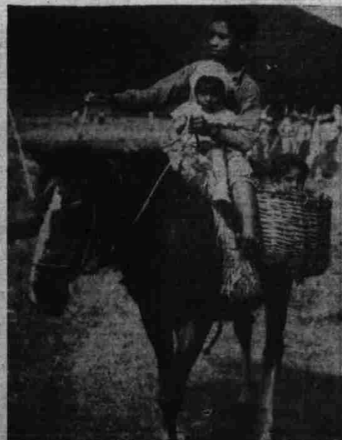
IN A SIDE-CAR (NO DRINK) rode this little native of Puerto Rico, on his way with brother and sister to market, to buy the week's supply of food. When the U. S. soldiers reach the Culebra and Puerto Rico area for war maneuvers, this will be