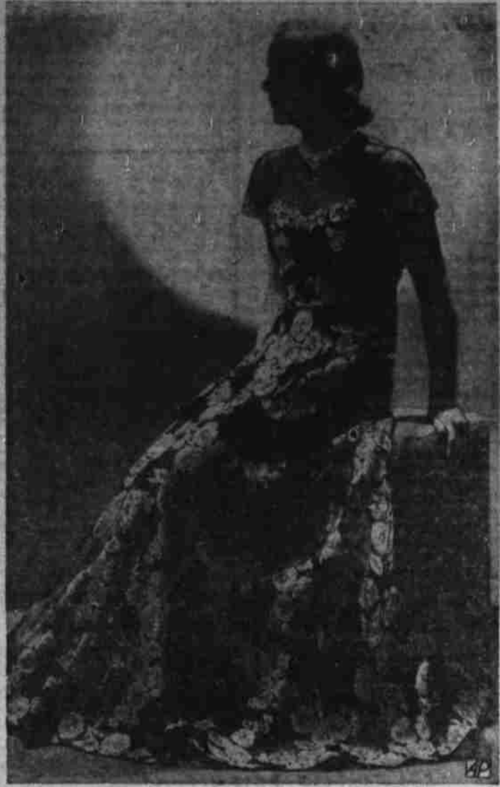
Here is a new dance frock for midseason wear, made of sheer black lace woven with pale green flowers. It is cut on body-molding lines with a fairly full skirt. The yoke and cap sleeves are of fine black net outlined with a band of flower motifs cut from the lace.