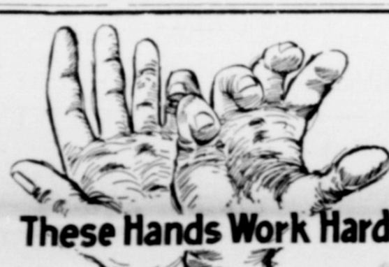
These Hands Work Hard

for a living - they could be yours. And if they are, make certain that some of the money they earn stays with the one person who deserves it most, you.