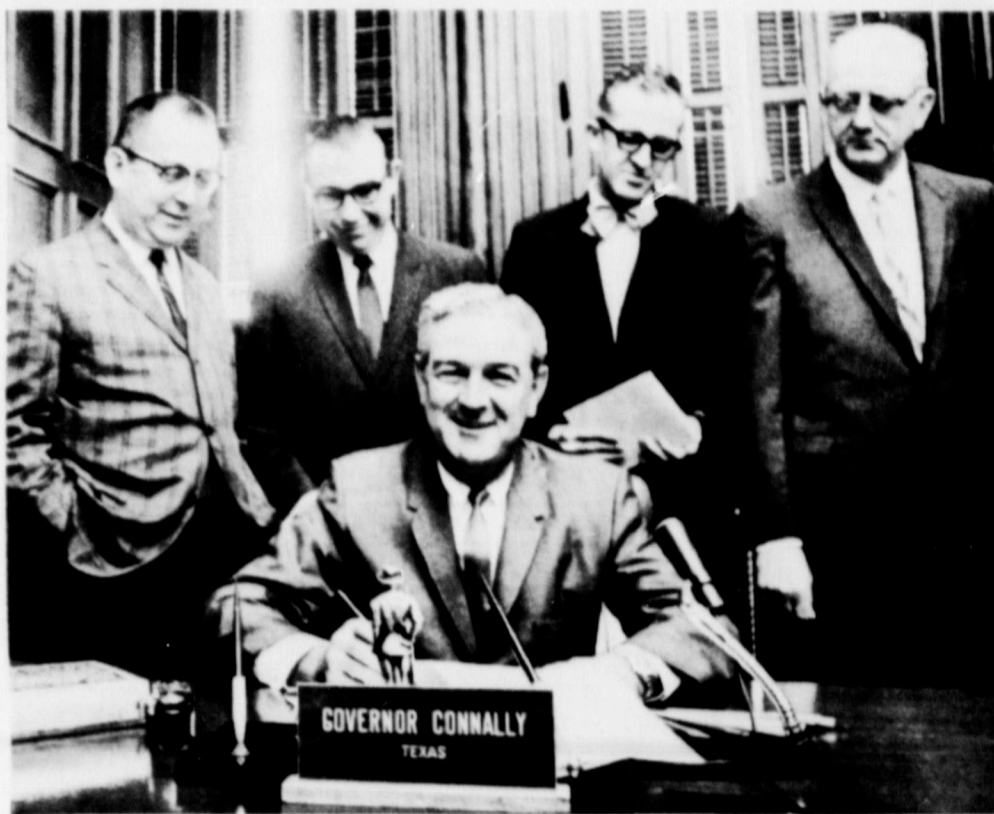
GOVERNOR CONNALLY TEXAS

According to the president of the youth group, all dances scheduled at the Youth Center will be parent sponsored and no drinking will be allowed.