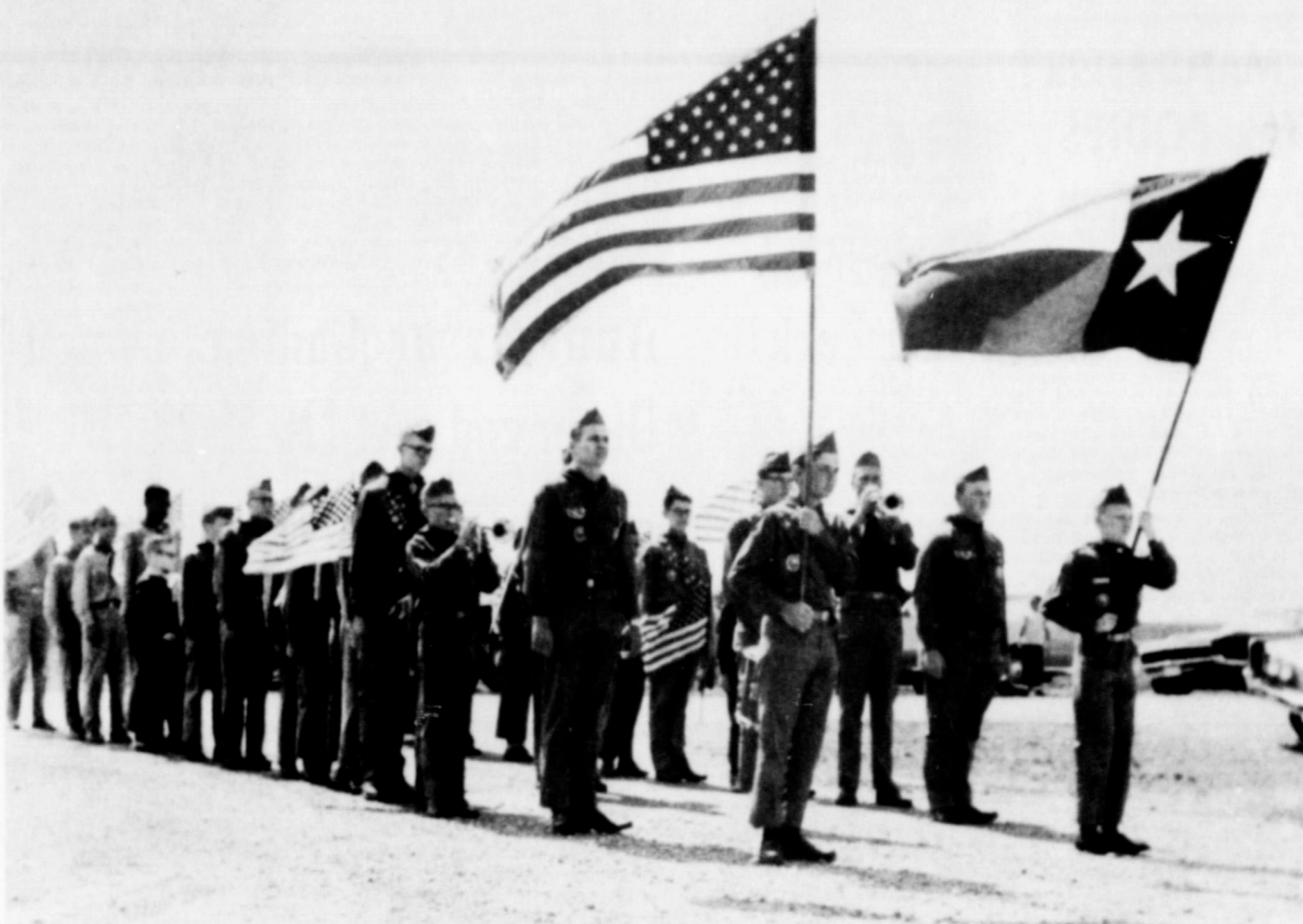
LOCAL BOY SCOUTS perform Flag Services Tuesday morning at both the Springlake and Earth Cemeteries. The local troop #614 is shown as the National Anthem was played.

Application for a Hill-Burton grant in the amount of $300,000 has been made. This if granted, will be applied to decreasing the indebtedness of the hospital.