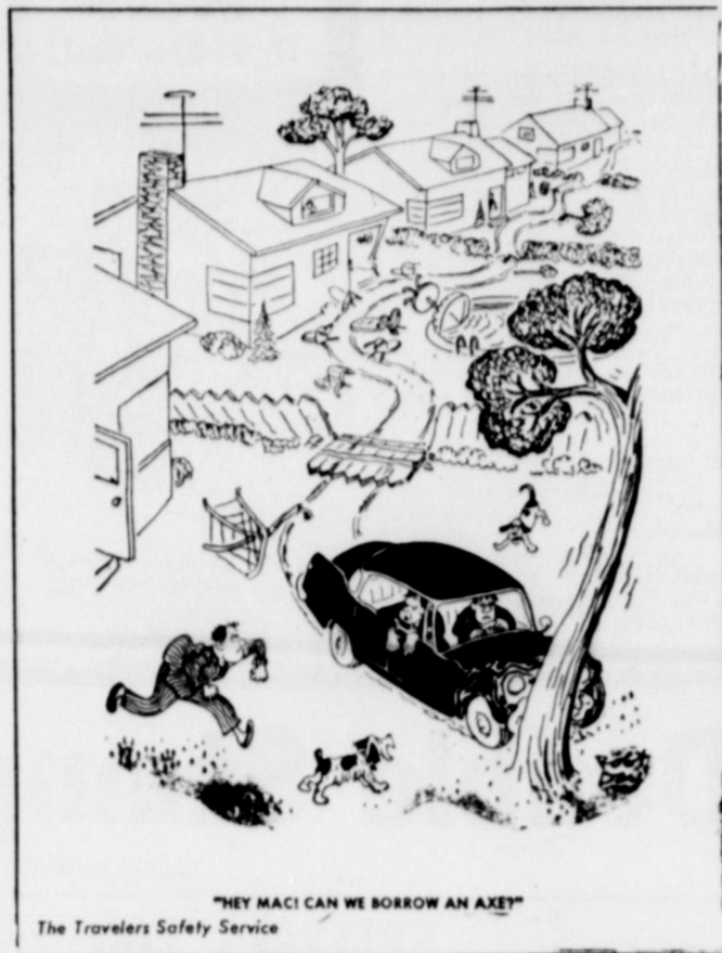
"THEY MIGHT CAN WE BORROW AN AXE?"