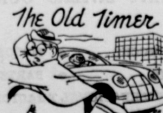
"You don't hear so much about the man in the street since automobiles have become so numerous."

He will deliver the message Sunday at the morning services at the Earth Spanish Mission and will be a guest at the Earth First Baptist Church Sunday night.