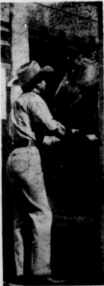
LOADING HORSES ON S. DAKOTA RANCH.