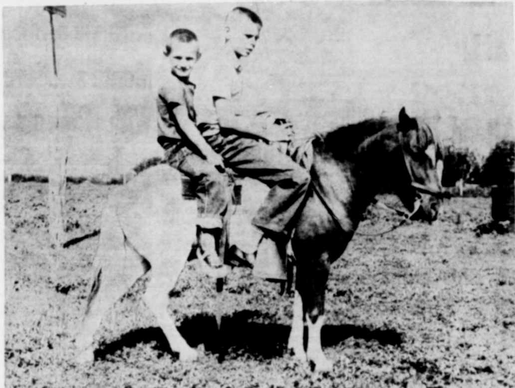
EVERY BOY DREAMS OF OWNING HIS OWN HORSE AND SADDLE - This beautiful shetland pony will be given by the Earth Jaycees to some lucky person between performances at the 17th Annual Earth Rodeo, Saturday night July 15 at