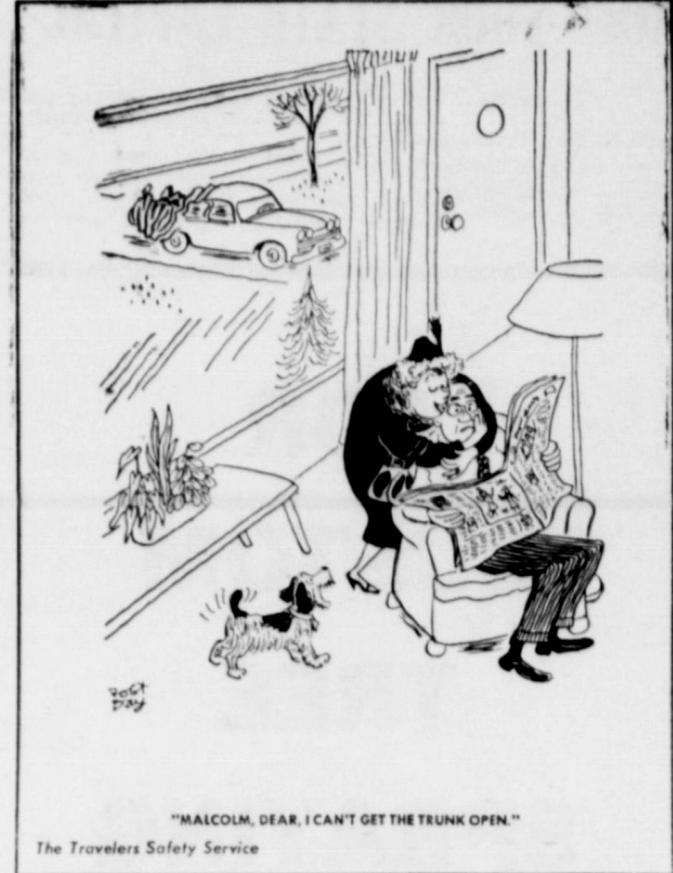
Women drivers were involved in more than 18% of the personal injury accident in 1960.