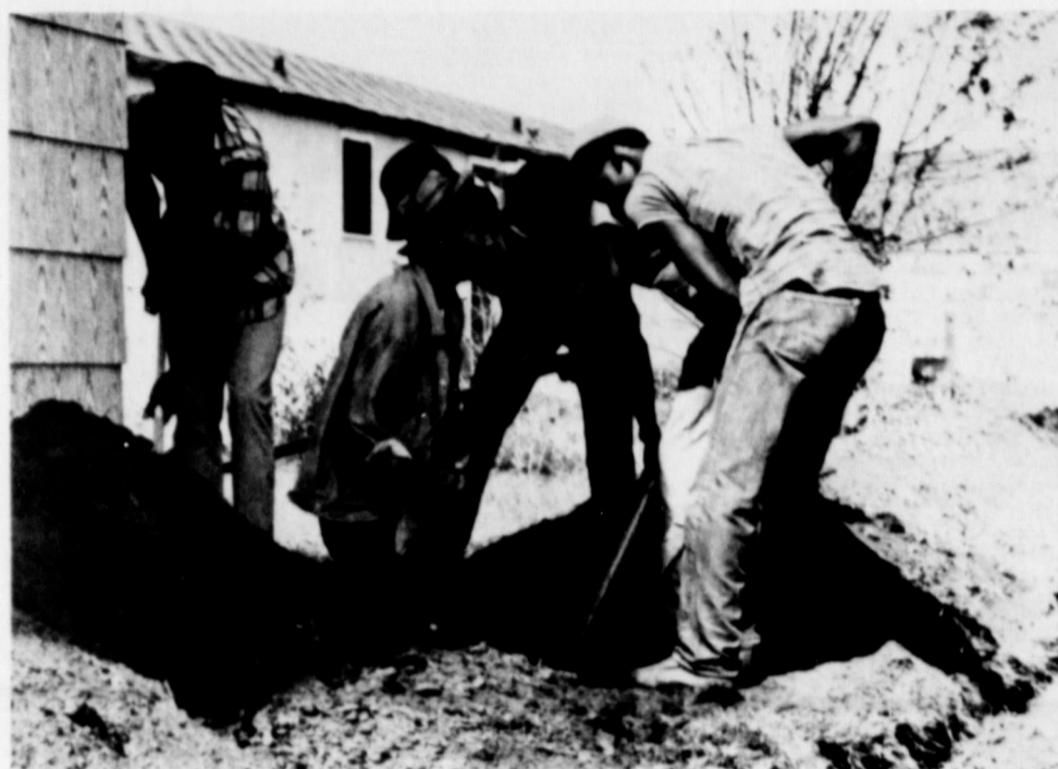
A LARGER SEWER LINE goes in on the faculty row of the Springlake-Earth campus. Increased housing on the campus has made the improvement necessary.