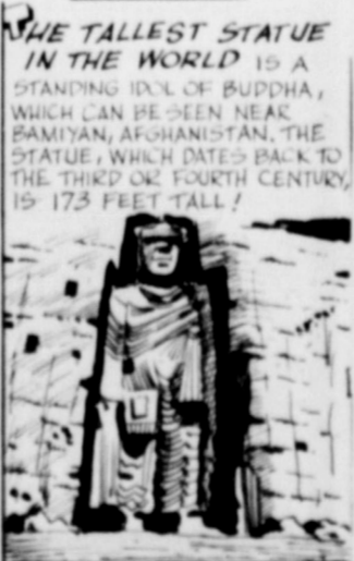
THE TALLEST STATUE IN THE WORLD IS A STANDING IDOL OF BUDDHA, WHICH CAN BE SEEN NEAR SAMYAN, AFGHANISTAN. THE STATUE, WHICH DATES BACK TO THE THIRD OR FOURTH CENTURY, IS 173 FEET TALL!