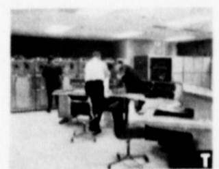
Powerful real-time Univac computers are now helping Wall Street brokerage firms automate and expedite their stock transactions.