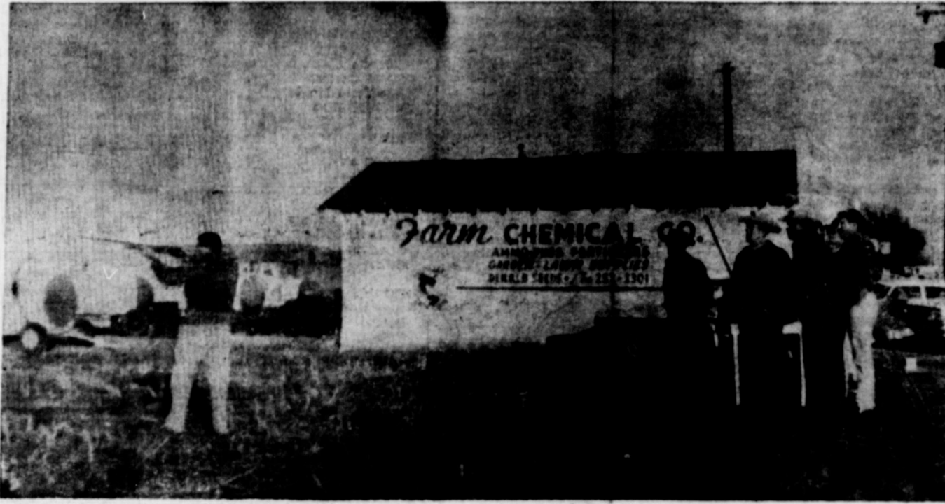
THE FIRST JAYCEE TURKEY SHOOT for this year was held Sunday afternoon just west of Farm Chemical Company building on Highway 70. Netting the local Jaycees $147 in cash. Prizes of