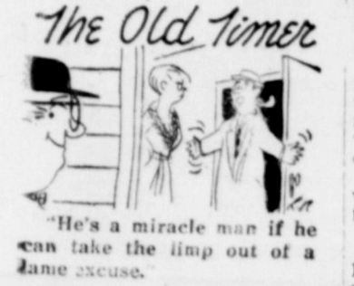
The Old Timer

SPECIALS FOR NOVEMBER 24-25-27-28 PATTERSON BROS. GRO. EARTH, TEXAS