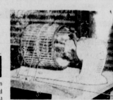
drum, the cleaner bolts are pulled through the water troughs. The ironer provides slow, steady power for the

opposite end of the bolt to the rewind reel. When the power is turned carded portable ironer. After re- on, the electric motor silently and efficiently pulls the bolt cleaner The ironer motor has enough power through the trough by winding the blower from a discarded evapora- string around the drum. When the Mr. Dunson cleans three troughs at cleaner has travelled the length of the trough, it is removed; and the two strings are tied together for rewinding. The rewind reel simply pulls the fishing strings back through the trough to the starting position, where they are then in inch water pipe cut in lengths of position for the next cleaning