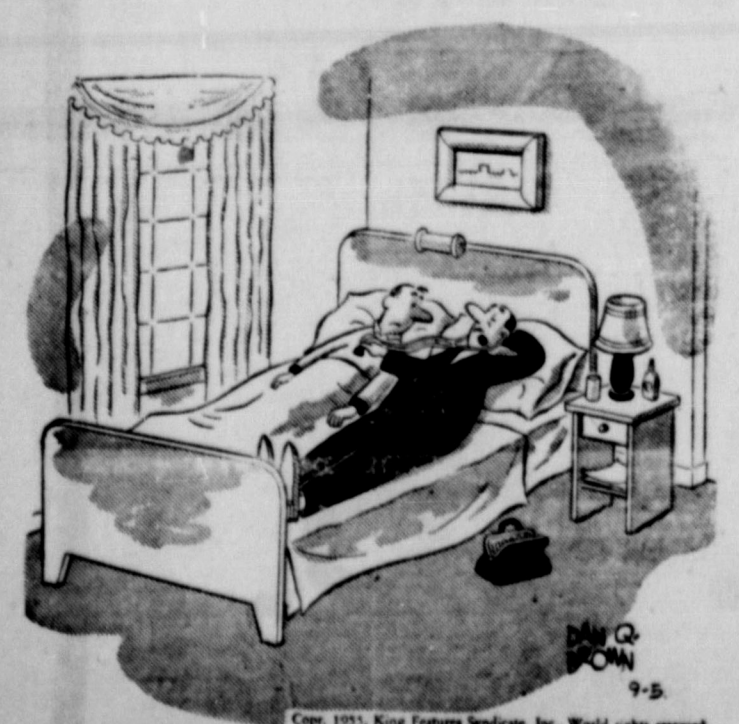
"Boy! I've been on the go since 3:30 this morning!"