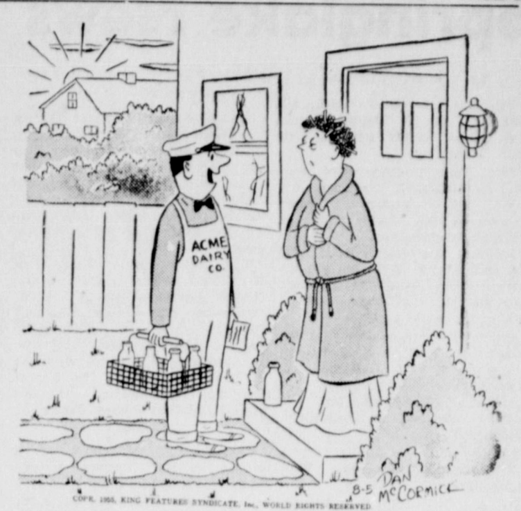
"I've been reading your notes for months, madam, and I ust had to meet the author of that beautiful prose."

THE EARTH NEWS, THURSDAY, FEBRUARY 23 1956 - PAGE 3