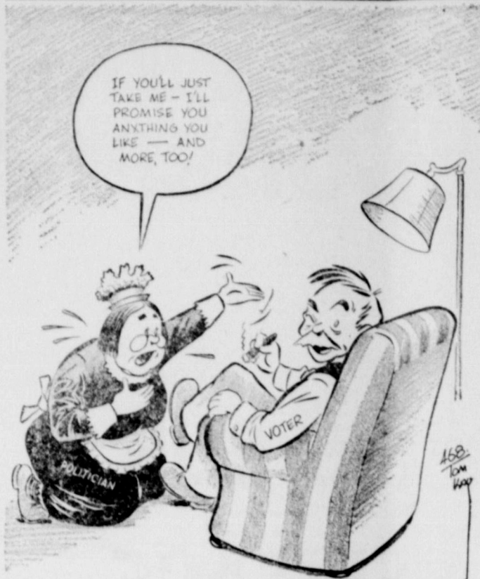
The "Leap-Year" Proposal

city Negro precincts, where the NAACP is strongest, gave his opponent, Ralph Yarborough, 87 per cent of the votes, compared with only 5.8 per cent for the Senator.