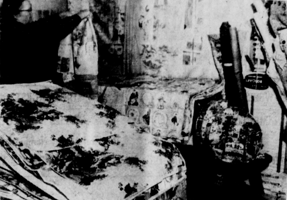
The photo above shows the interior of McCormick's Upholstery in Muleshoe. This firm makes custom drapes, upholsters furniture, makes custom auto seat covers, irrigation tarps, canvas tubing, truck tarps and boat covers. It is owned by L. F. McCormick.