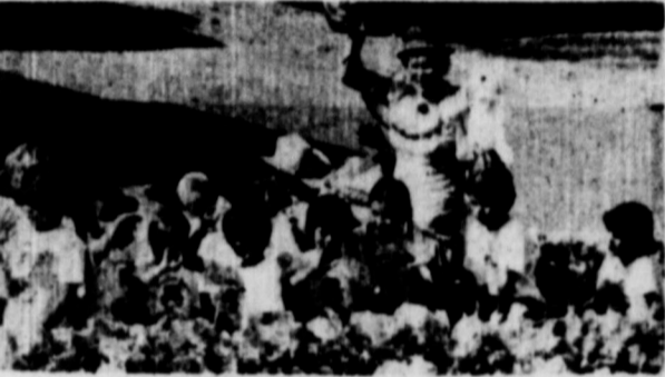
EVEN THOUGH the day was hot, Sunshine Sally warmed the hearts of hundreds of kids.