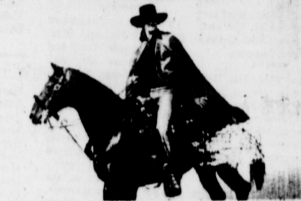
THE TEXAS TECH Red Raider made a special appearance by leading the parade through town last Thursday.