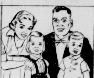
By following the rules of good hygiene, American families are the healthiest in the world.