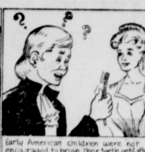
Early American children were not encouraged to play their teeth until after their "second" teeth had grown. Dentists today say a child would be taught to brush his teeth at the age of two. Modern babies for children are treated with an anti-bacterial that destroys oral cavity germs that fall or settle on brushes.