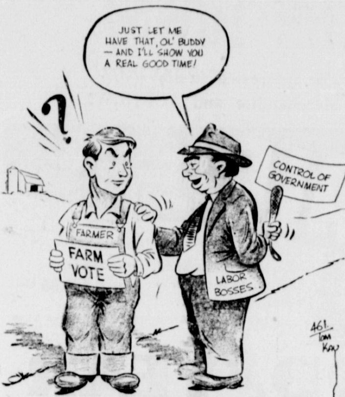
Beware the Blackjack