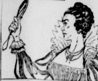
Women in Elizabethan times did not realize the value of washing or cleaning the face at frequent intervals. Many suffered from ugly skin blemishes. Modern women make use of crepe, complexion because of skin care.