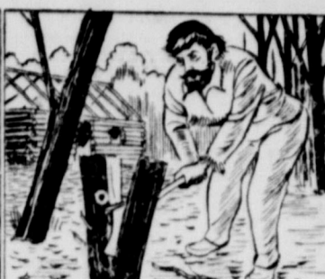
The first American settlers got plenty of healthy exercise in the outdoors just by doing their daily work. Many modern men who spend working days at offices, must plan their exercise through walk-end and after work recreation.