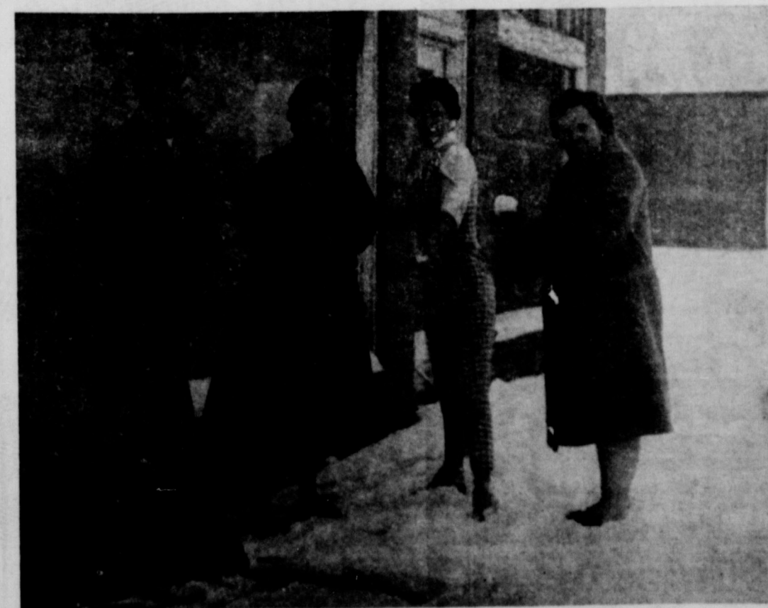
SNOW BREAK . . . Coffee breaks have become customary in almost every firm throughout the nation. Here the News staff have taken time out for a snow break, as soon as the snow piled up deep enough to really enjoy snowballing. Pictured with shovel, looking as though he meant