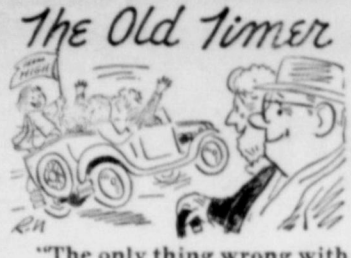
the younger generation is that so many of us don't belong

ployees. Den 2 has decided to take It was reported that they did a its train trip on March 25 from Muleshoe to Littelfield. Tickets will be 45 cents for the boys and 99 cents for the adults that take Friday also and were accompanied were present.