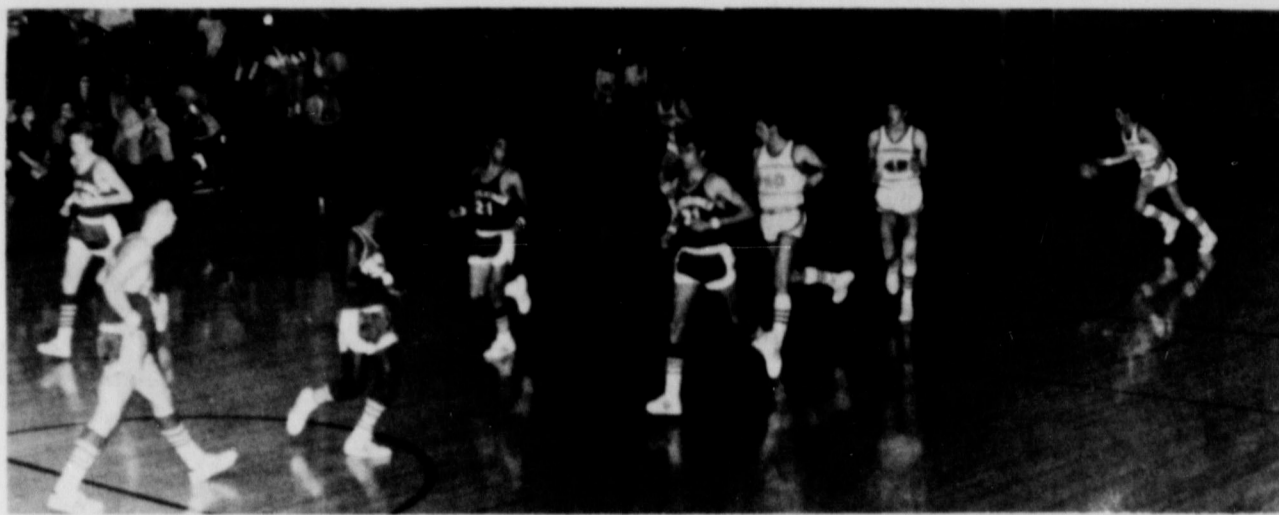
WOLVERINES OPEN DISTRICT PLAY-With an impressive win against the Kress Kangaroos Tuesday evening, winning the game with a score of 74-44. The Wolverines were in the dark suits.

There were 446 memberships issued to breeders of registered Aberdeen-Angus in the United States during the past month.