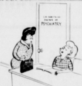
"I suppose I should have my head examined coming here..."