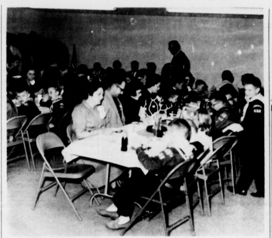
A LARGE CROWD attended the Blue and Gold Cub Scout Banquet at the Earth Building Tuesday night.

by Assassination, "Since Oswald was a known Marxist commun-