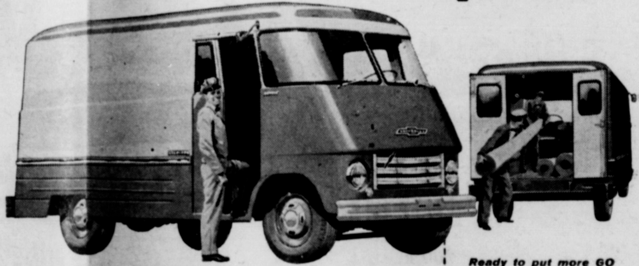
Model 3445 Step-Van with 8-foot body

For the first time Chevrolet offers forward control delivery trucks equipped with handsome, spacious walk-in bodies—the new Step-Vans! You'll find new hustle, new muscle and new style throughout Chevy's light-duty lineup for '56!