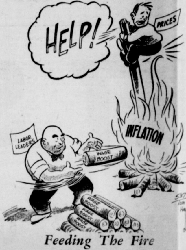
Feeding The Fire