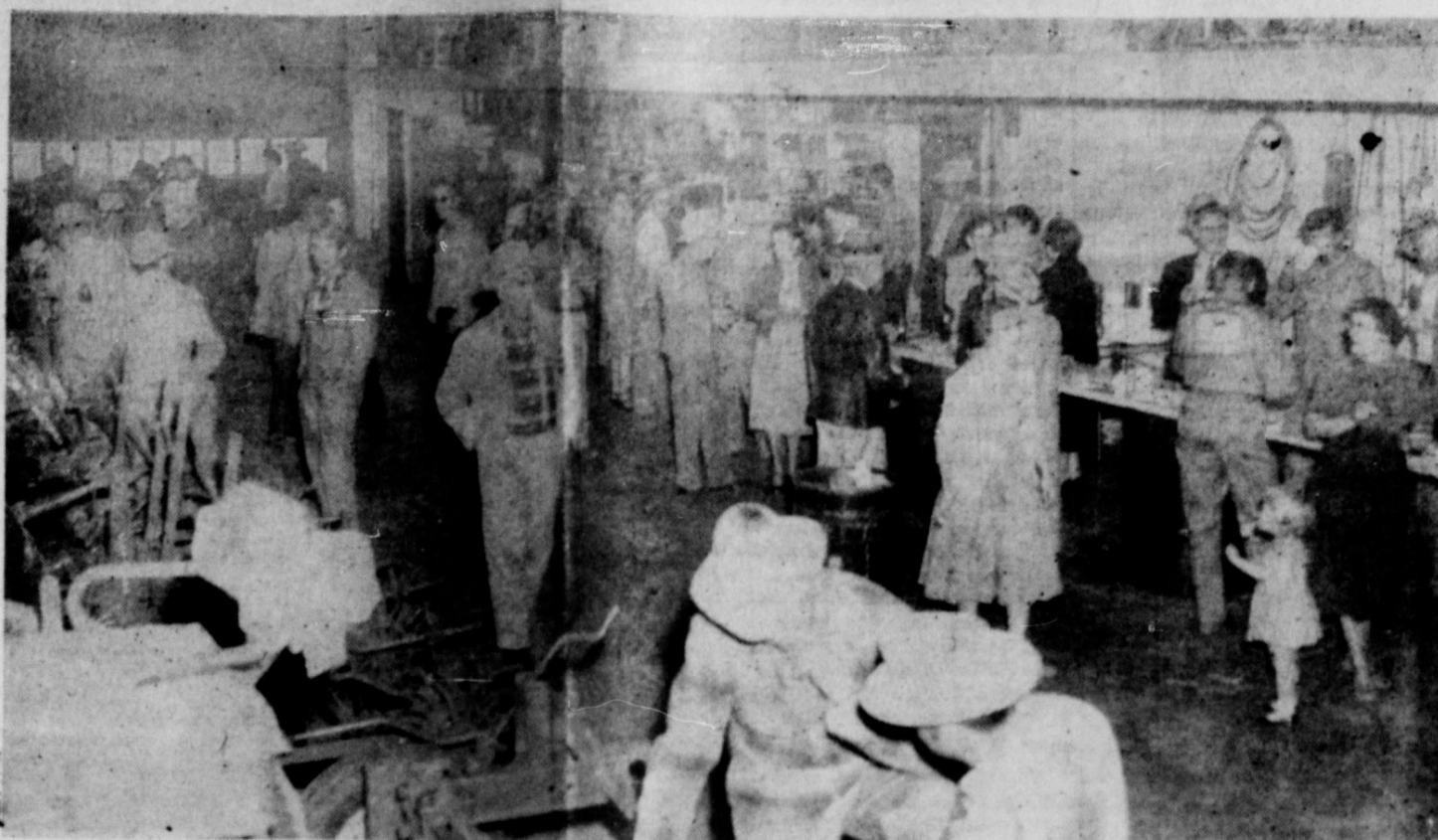
GOOD FARM EQUIPMENT, GOOD FOOD AND GOOD FELLOWSHIP were the order of the day last Friday when the Dent Farm Stably observed their annual John Deere Day. The latest models of John Deere equipment were on display. Approximately 250 persons enjoyed a delicious lunch of chili, beans, doughnuts, coffee and soft drinks. A free show was held at the Earth Theatre in the afternoon to complete the days program.