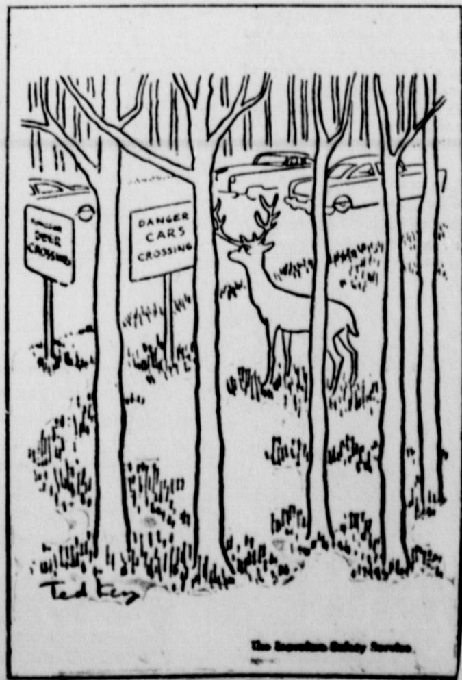
The Insurance Safety Service.