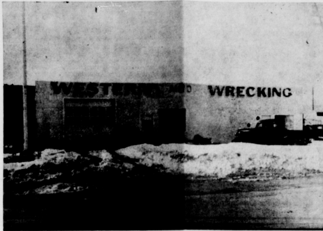
All types of used parts for trucks, tractors and irrigation engines can be found at the Western Wrecking Co. in Muleshoe. This firm also sells used irrigation engines.