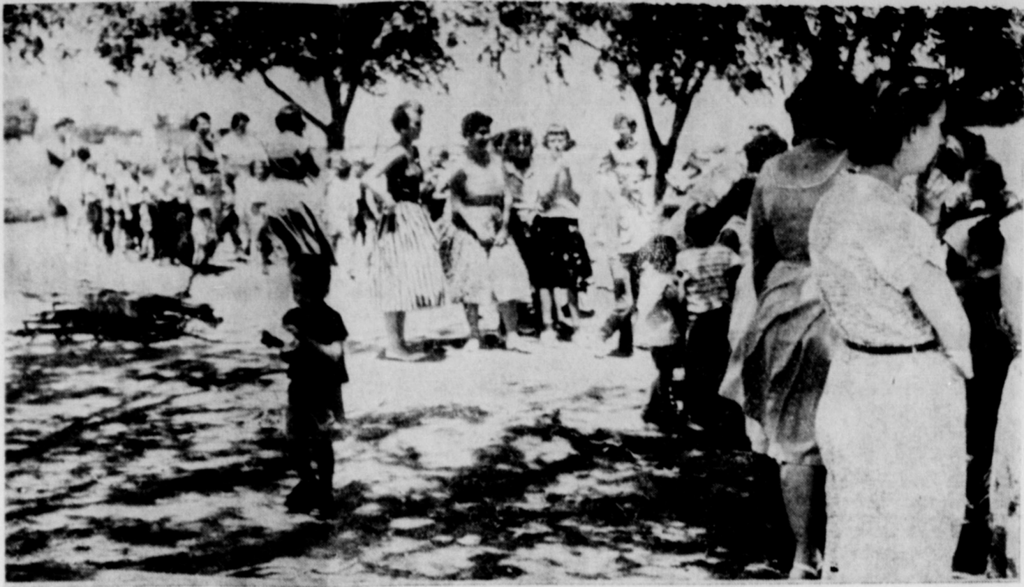
The Annual Baptist Vacation Bible School Picnic was held last Friday at the Rodeo Grounds. All the smaller classes and their teachers attended.