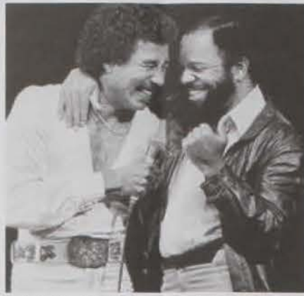
In this June 15, 1981 photo, Smokey Robinson, left, is joined by Berry Gordy at the Greek Theater in Los Angeles.

Robinson and the Miracles attended high school together, while Ross and future Supremes Mary Wilson and Florence Ballard grew up in the city's housing