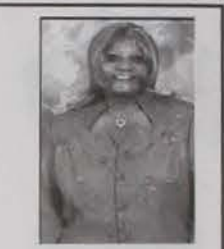
Fashion...always wear a smile.

lots of bold colorful prints, designs that will take your breath away. Every top, blouse, sweater or shirt will make a fashion statement. Ruffles are great! emerging more in sheer fabrics for the fall. The softness of sheer will warm your hearts and grab the attention of others. GOING SHOPPING? remember not to over look that beautiful blouse, just because it's sheer, sheerness is what's happening this fall.