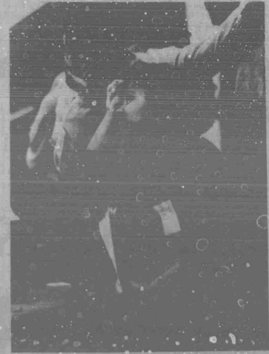
For a former auditioning for a role, waiting can be the most difficult part of the experience. The faces of these North Carolina School of the Arts (NCSA) students mirror the tension of the situation as they wait their turn for an auditor for a role in Sam is an NCSA production that will tour the nation this summer. Sam is sponsored by R. J. Reynolds Industries, Inc., will be performed in more than 20 U. S. cities in a two-week tour beginning July 1.

NAACP president Benjamin Hooks said he had no confidence that the administration would carry out the law.