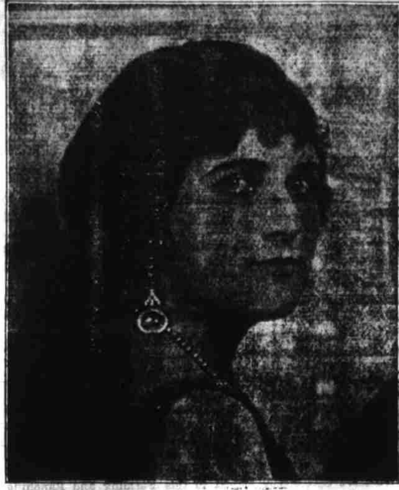
BONA SWANSON VER HAAR, NOTED SWEDISH CONTRALTO IN CONCERT AT CHAUTAUQUA