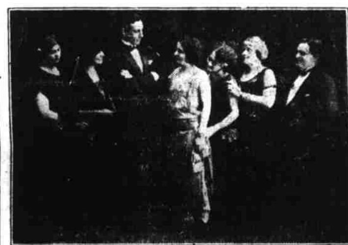
Catchy Songs, Beautiful Voices, Delicious Humor-A Treat for the Whole Family.