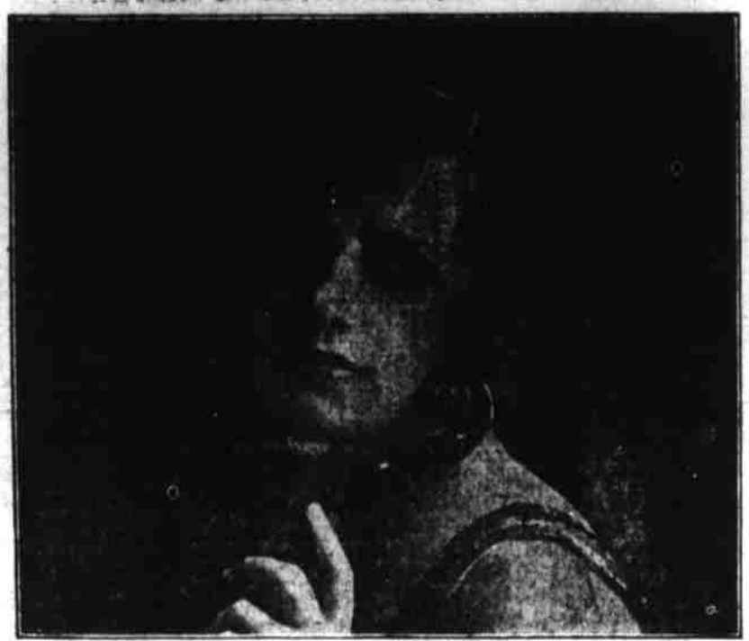
IRENE STOLOFSKY. FAMOUS POLISH VIOLINIST WITH SUPPORTING ARTISTS AT CHAUTAUQUA IN CONCERT.