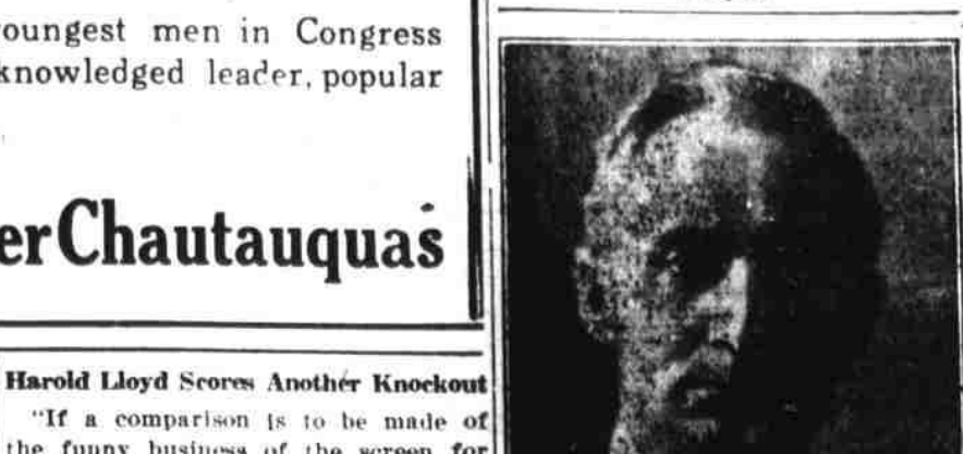
A Message for Misfits at Chautauqua