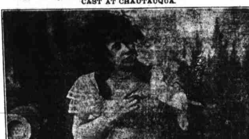
STAR OF "KATRINKA" AND "THE BLUE KITTEN," IN "COUSIN MARY" AT CHAUTAUQUA