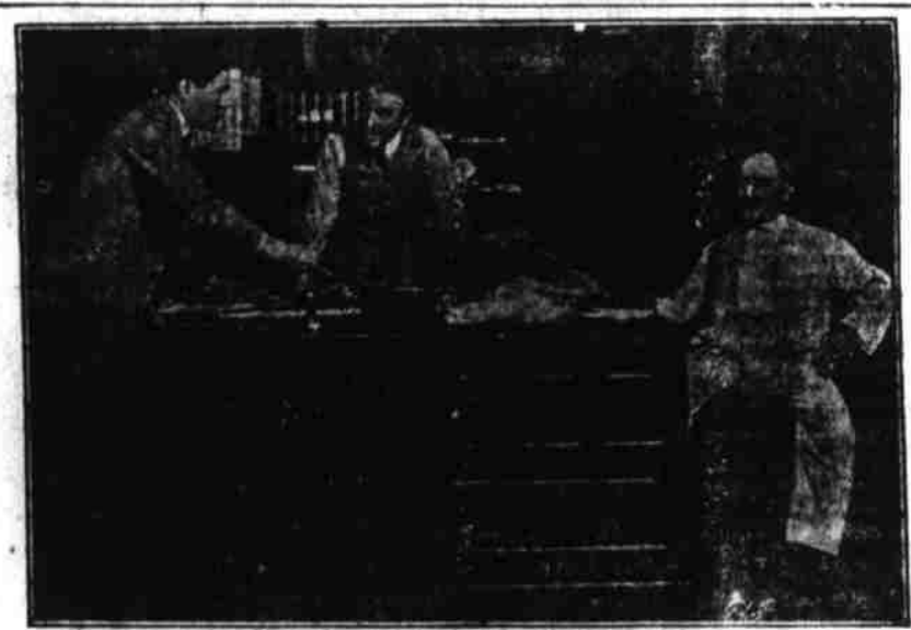
SCENE FROM POTASH AND PERLMUTTER WITH NOTABLE CAST AT CHAUTAUQUA.