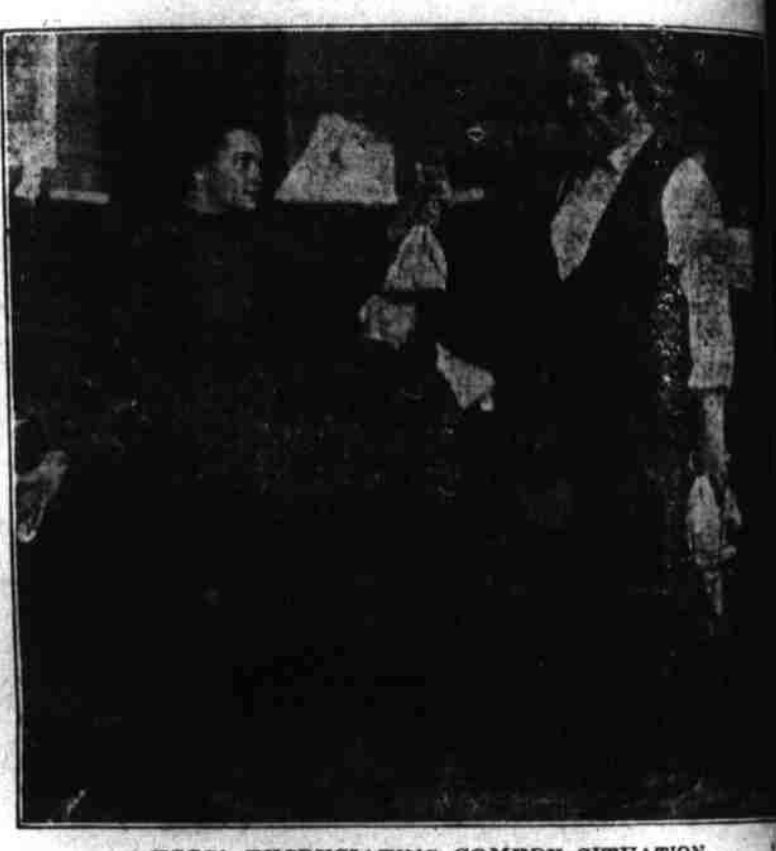
EGGS! EXCRUCIATING COMEDY SITUATION "IN THE PRINCE CHAP" APPEARING AT CHAUTAUQUA