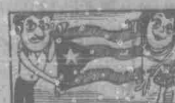
A model of the Puerto Rican flag was first developed in 1895.

High School and groom graduated from Dunbar High School. The couple will reside in Lubbock.