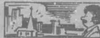
The largest Baptist congregation in the world is the Abyssinian Baptist Church in New York City, established 1808.

Copyright, 1982, United Feature Syndicate, Inc.