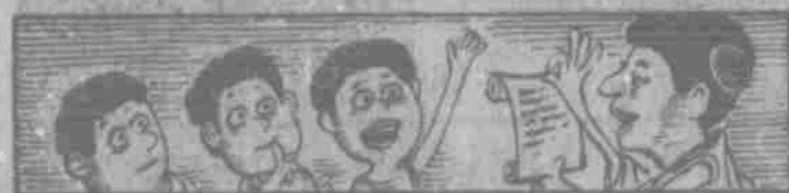
Some 500 years ago, when most Europeans could neither read nor write, a kingdom in Africa had an official public school system.

The next article in this series will continue the explanation of changes made by the 1981 Amendments to help strengthen the financial status of the Social Security system.