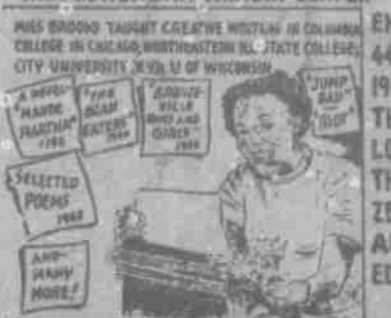
AND BROODS THOUGHT CREATIVE WRITERS IN COLLABORATION... (text partially obscured)