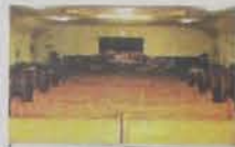
Whose Pew Will You Sit On?