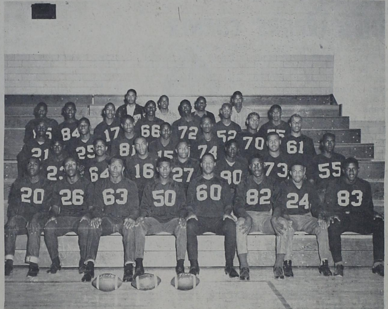
1962 State Runner-Up Dunbar Panthers