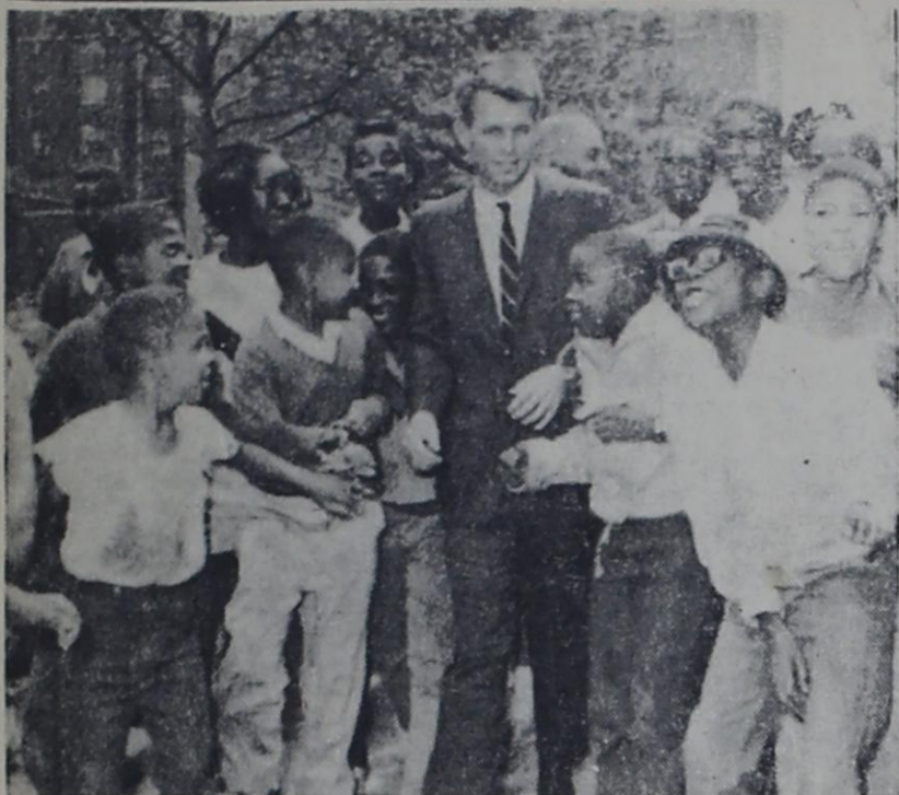
"Bobby" and Kids---U.S. Attorney General Robert F. Kennedy was surrounded by boys and girls as he arrived for a visit at the Morningside Community Center in New York last month. Kennedy, chairman of the President's Committee on Delinquency, visited several centers where summer training remedial reading courses are being conducted for children.