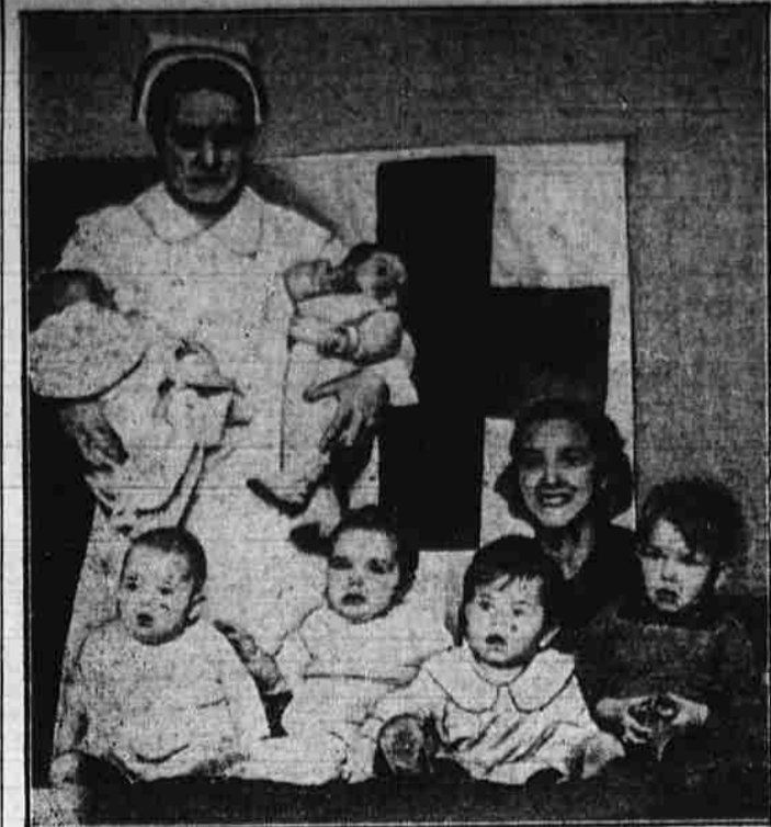
A schoolroom becomes a nursery for babies of flood refugee families, as the Red Cross nurses seize such opportunities to teach mothers in home hygiene and health rules for the infants. It all is only a part of the great work of the Red Cross, which currently is making appeal for 1937-38 funds.