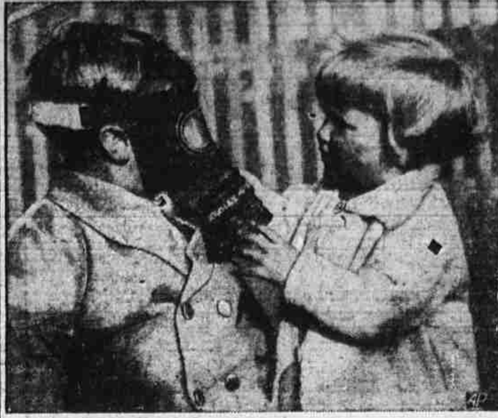
TOY FOR TOMORROW? Knowing elders may shudder at this but not the British children for two to four years old at Dr. Barnardo's home for orphans...