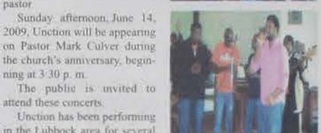
Pictured above are photos of Uncion while appearing at Bethel African Methodist Episcopal Church.