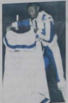
Who was the first Matador? Here he is.