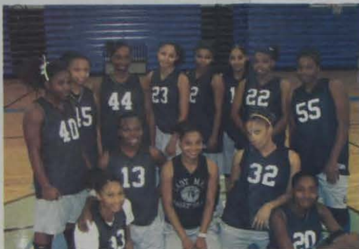
The 2009 Lady Matadors