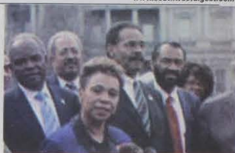
Congressional Black Caucus chair Rep. Barbara Lee, D-Calif., at microphone, talks to reporters outside the White House following a meeting with President Obama.

May God continue to bless each of you until we see you on Saturday morning, March 28, 2009. Remember, He will make a way, no matter what!