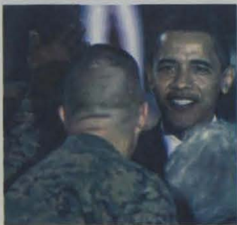
President Barack Obama greets Marines following his speech at Camp Lejeune, N.C., Friday, February 27, 2009.