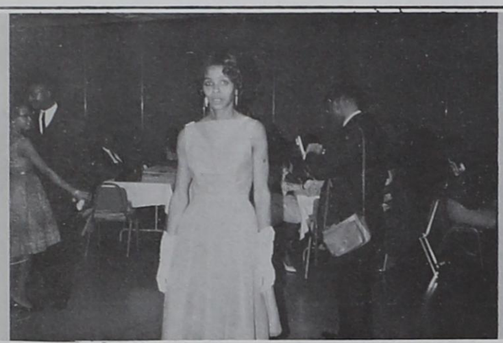
Here are a few snaps taken at the Beautician

Any erroneous reflection appearing in this newspaper will be rected immediately when called to the attention of the editor.