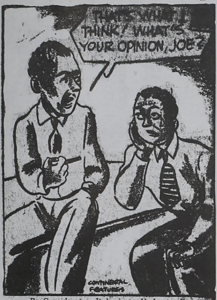
Be Considerate. It leads to Understanding