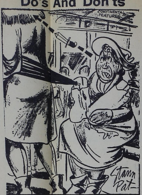
It May Be Easier to Carry That Way. But Think of Others.