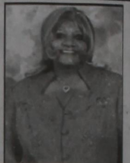
Fashion tip..always wear a smile ***** Fashion..just for the fun of it

The number one fashion item for the fall season is the trench coat, that's right ladies, it's back and it's more popular than ever, double breasted, belted and all. Now you tell me ladies, how great is that. Three colors -- red, black, tan. AT YOUR BETTER DEPT. STORES.