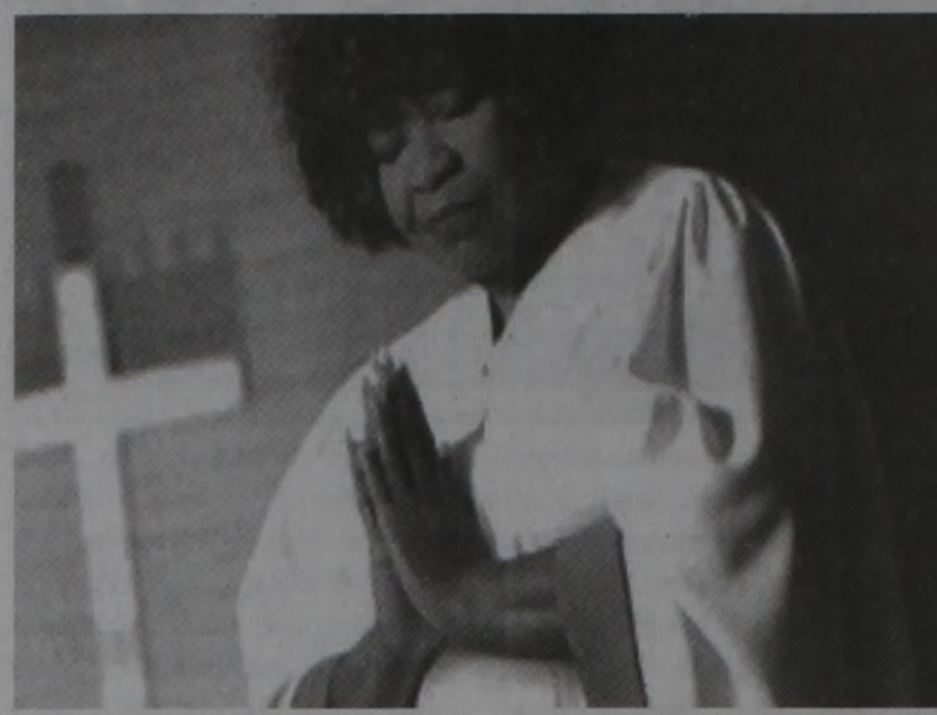
Albertina Walker - Founder of The Caravans