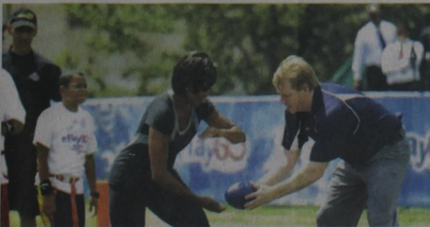
OUR FIRST LADY, MICHELLE OBAMA is shown receiving the football from NFL Commissioner Roger Goodell and former NFL Coach of the Year, Tony Dungy in the background. Love this sister girl!! Would any other First Lady have chanced it?

First lady looking GOOD, she's ready for some football, You go President Barack Obama!!!