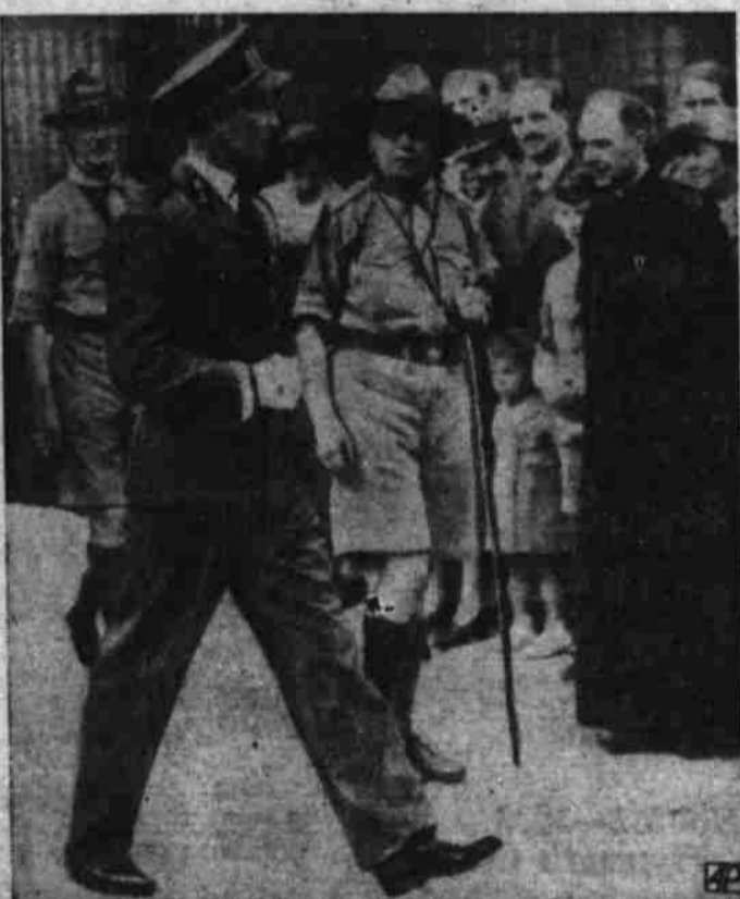
HONORING SCOUTS. King Leopold marched in Brussels, celebrating 25th anniversary of Catholic Scouts of Belgium.