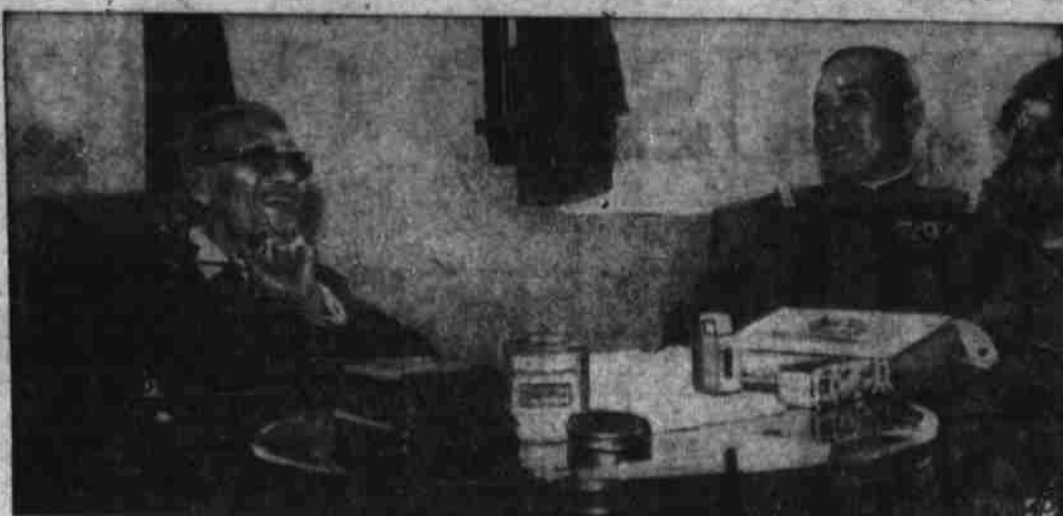
PLEASANTRIES OF WAR were exchanged when Dr. Wang Keh-min (left), puppet of the Japanese-established provisional government at Peking, visited with Gen. Shunroku Hata, commander of the Japanese armies in central China. They met at Shanghai, and after this apparently congenial session, Keh-min went to Tokyo, flying from China in a military plane.