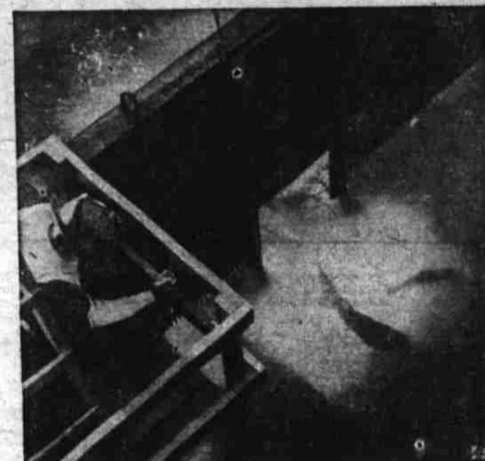
FISHY CENSUS is taken by counters as Columbia river salmon pass over white platform, using the $6,500,000 highway to get upstream at Bonneville dam, a $52,000,000 government project. The fish climb about 63 feet, passing the dam.