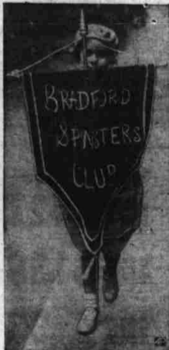
SPINSTERS on parade in London, where they urged pensions for maiden ladies past 55, had this young girl in marching contingent. A national Spinners' Pensions association in England backed the movement for middle-aged women.