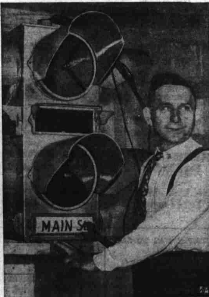
STOP CLOCK to keep pedestrians from being trapped by light change was invented by the Ebert brothers of Kenmore, N. Y. Clock hands in face of red signal tell when light will change.