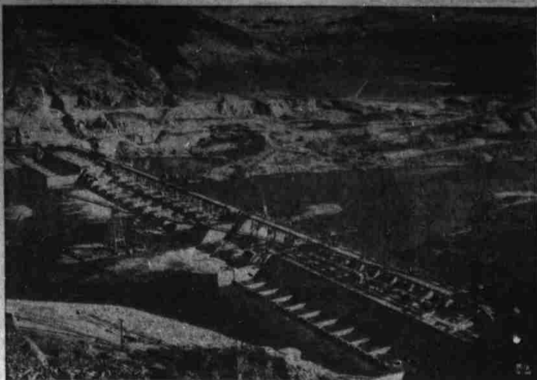
HALF-WAY MARK IS REACHED on Grand Coulee dam, $114,000,000 federal project on Columbia river, Washington. Dam will be 530 feet high, contain 11,250,000 cubic yards of concrete.