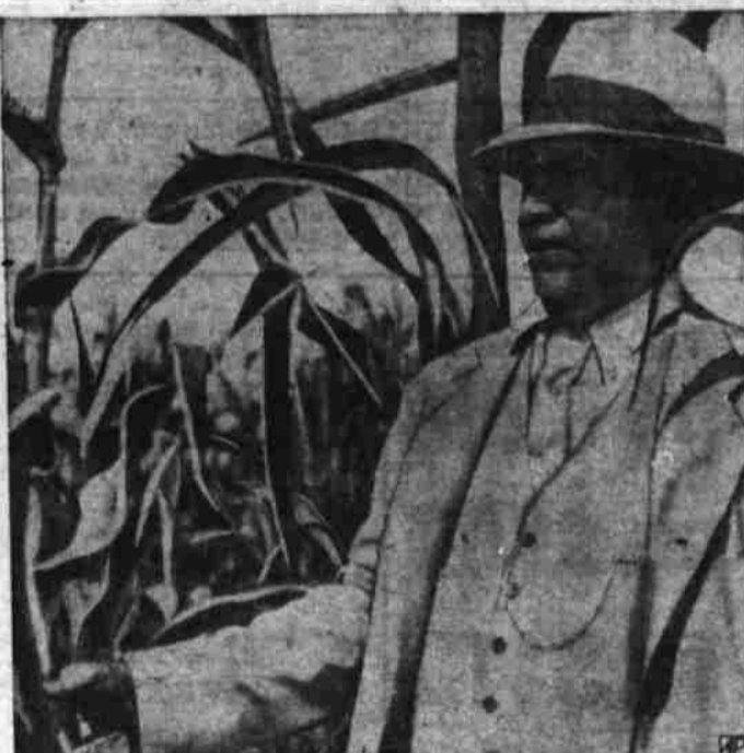
REBEL-FARMER Gen. Saturnino Cedillo inspected his corn before being driven to the hills by approach of federal troops loyal to Mexican President Cardenas. Nipping the revolt, soldiers captured Cedillo's ranch in San Luis Potosi.