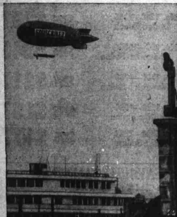
DEFENSE HIT A HIGH at Paris when blimp urging "Subscribe" appeared in interest of national defense loan.