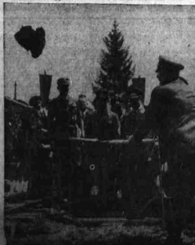
"EUROPE'S LARGEST" is Nazi claim for waterpower plant begun at Zell-on-Rhine by Goering, who turned first spoke.