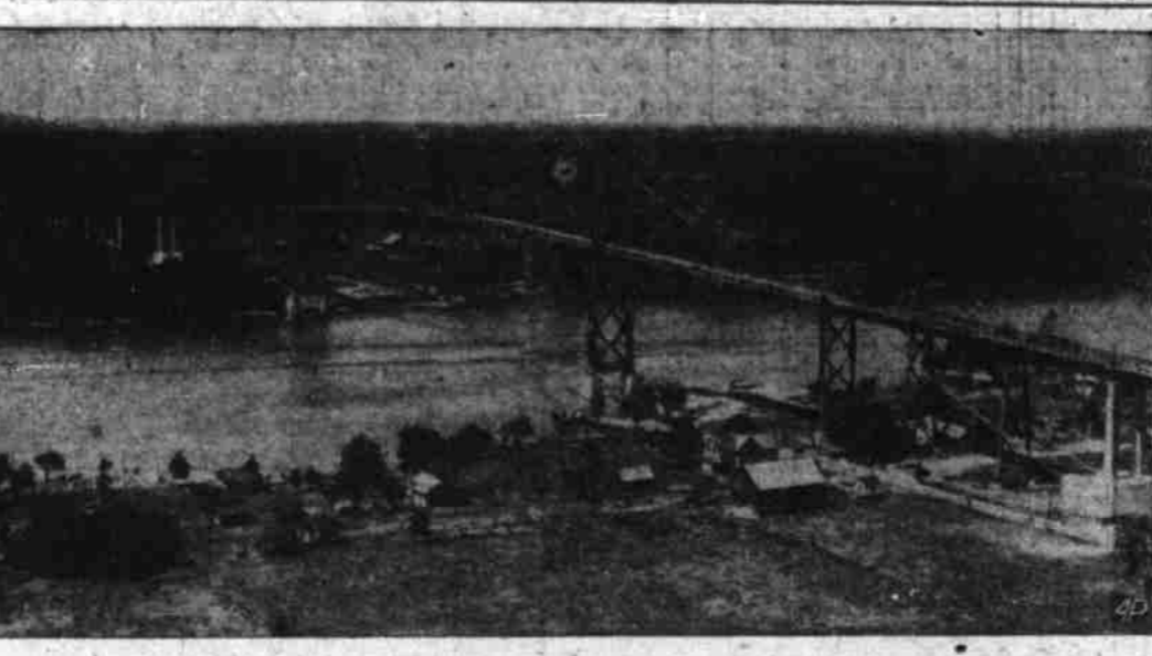
VIEW OF AMERICAN SIDE of Thousand Islands bridge system shows Collias Landing, N. Y., in foreground. This suspension bridge has 800-foot main span, with under-clearance of 150 feet above water; it extends to Wells Island. The International Rift, Hill, Constance and Georgina Islands are all utilized to support the various spans. The spans have two-lane roadways and two sidewalks.