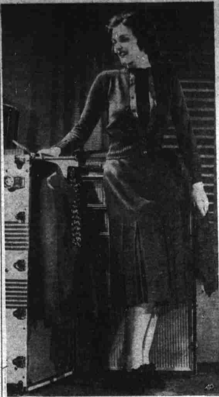
Something designed to help the college girl balance her wardrobe budget is a sport suit combining a pleated skirt and cardigan sweater of naphtha-cleaned wool dyed exactly the same shade. This one is a warm copper tone which offers harmonious contrast to the brown sweater worn under it.