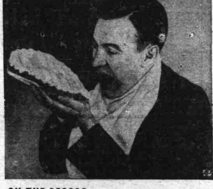
ON THE RECORD, pictorially, is view of Pie "Harold J." Traylor, Pirates manager, getting chummy with a pie on a California movie lot—to indicate a fondness for it. But there's dispute as to how Pie got his nickname.

Communists (Continued from Page 6). port of munitions and all other material essential to the conduct of war, through mass demonstrations, picketing and strikes.