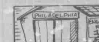
The first fire fighting organization in America was started in Philadelphia.