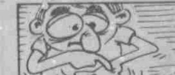
A human being sheds skin continually, replacing it with an entire new outer layer about once every 28 days.

Next issue: Part II-The Organizational Structure and Departments of the A.M.E. Church.