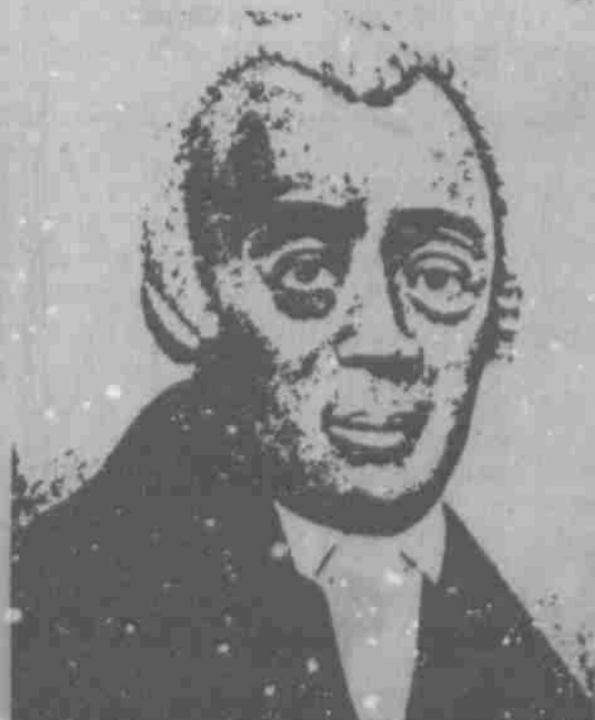
Bishop Richard Allen

The immediate cause of the organization of the A.M.E. Church was the fact that members of St. George's Methodist Episcopal Church in Philadelphia, Pa., in 1787 segregated its colored members from its white communicants. Blacks were sent to the gallery of the church and one Sunday as they knelt to pray outside of their designated area, they were actually pulled from their knees and told to go to the place which had been specified for them. This act was insulting -- So the African people replied "Wait until prayer is over and we will go out and trouble you no more." They then went out into the blacksmith shop of Richard Allen and formed the Free African Society, and from this society came two groups: the Episcopalians and the Methodists.