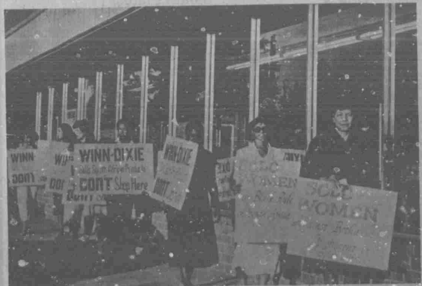
SCLC/WOMEN lead protesters at an Atlanta Winn-Dixie store to protest sale of fruits and fish from South Africa. Demonstrations are being conducted at stores across the south operated by the 1266-store Florida-based Winn-Dixie chain.

The Senior Choir has been invited to sing at West Texas State University at Canyon, Texas.