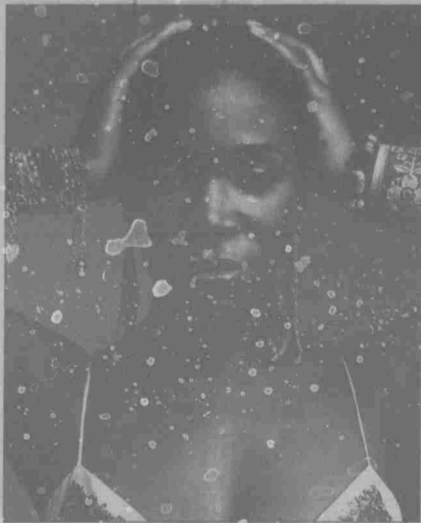
Atlanta born folksy soul singer who made being 'Jeggy cool' again. A contemporary of her Nubian goddess peers Erykah Badu, Jili Scott and Macy Gray. Armed with just an acoustic guitar she has managed to change the hearts of millions.

India's ability to dig deep paid off big commercially - it earned the Grammy winner her first No. 1 album debut last week, with sales of more than 160,000. In addition, "Testimony," her third album, has garnered mainly positive reviews.