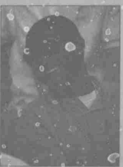
Usher, 27-year-old Usher said in a statement.

"I have always admired Broadway actors for their showmanship, dedication and focus that goes into performing live on stage every night," the 27-year-