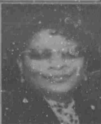
We Love You and Miss You Very Very Much.