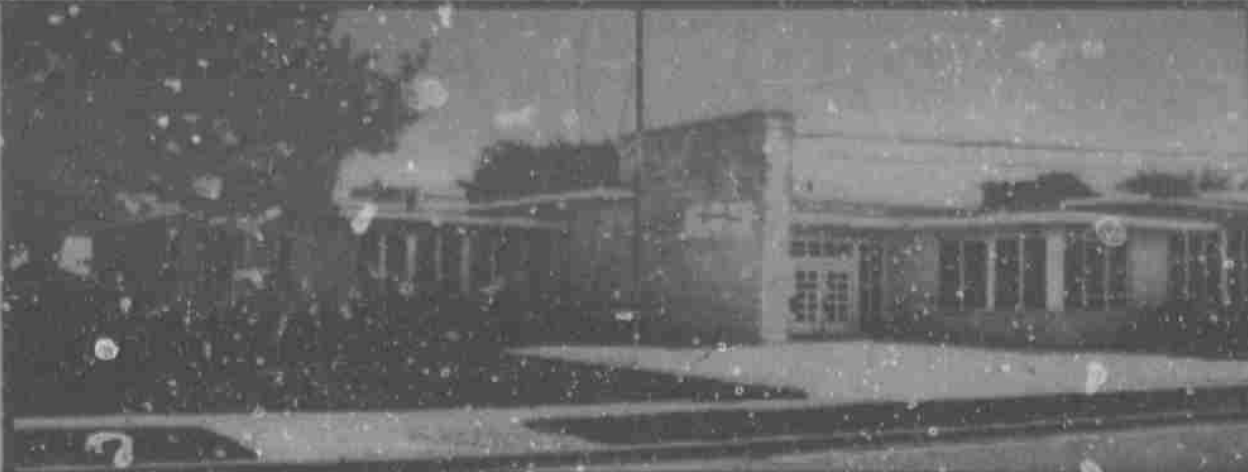
This is the location of the new Eddie Richardson Early Child Center at The Bridge which is located at 1301 Redbud Avenue. The dedication of this facility will be held Wednesday morning, October 15, 2008, from 10:00 a. m. until 12 noon. This is the former Posey Elementary School. The public is invited to attend.

All neighborhood residents are asked to be in attendance. There is some important business which needs to be discussed. Bring someone with you. The Association needs you.