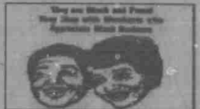
They are Black and Proud. They are with America. They are the American Majority.

With stock losses occurring every day, people are wondering what to do about their money in banks. If you have over $100,000 in all of your accounts at one bank, you need to move the coverage to another bank, that is, if the bank has F.D.I.C. coverage. The F.D.I.C. (Federal Deposit Insurance Corporation) covers deposits in banks with the insurance. If your bank is not covered under the F.D.I.C., then you need to move your money to an insured bank. The Bailout package raised the amount of bank insurance for the future. A portable home vault that only weighs about fifty pounds is a waste of money. A thief can carry it off just like you brought it in. Money is still safer in banks. Only the people with megabucks really need to worry right now. We all need to get 'in cinque' and make the right choice on Tuesday, November 4, 2008 and vote to stabilize our government and our money. I already did!