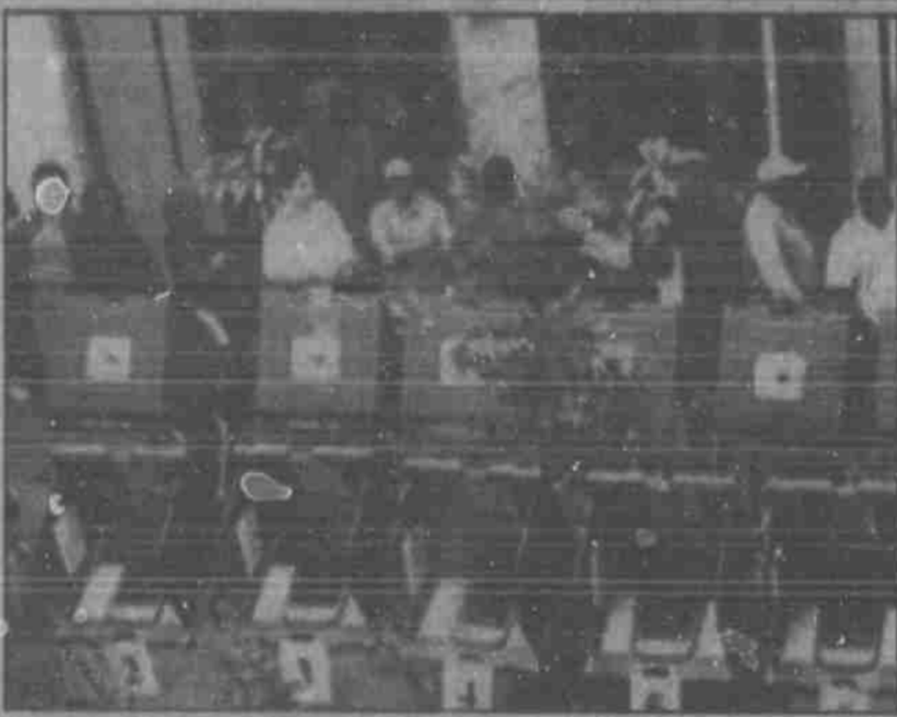
Voters line up to cast their ballots as they vote early at a shopping mall in Overland Park, Kan. Thursday, Oct. 23, 2008

Absentee voting - as the name suggests - was originally designed for people who couldn't make it to the polls on Election Day. But this year, more than 30 states allow any registered voter to cast an early