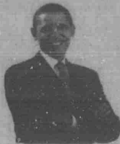
Barack Obama President