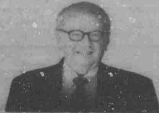
Dwight Fullingim U.S. Congress