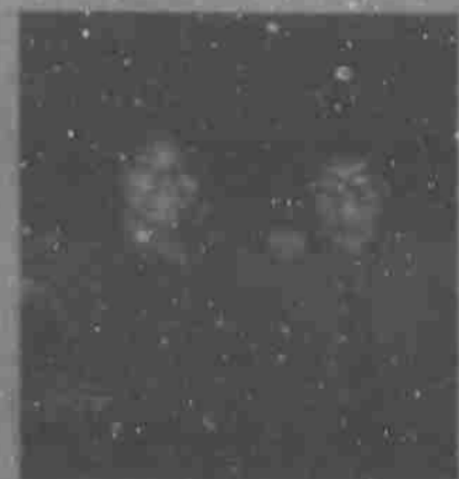
Here are two photos of the young people who were participants in the first ever "Mr. Alderson Contest" which was held Friday, October 10, 2008, in the Alderson Auditorium. More on Page 5.

If you have an announcement you want to appear in this paper, there are many ways to get information to us. Southwest Digest Community Meetings 1702 Avenue G Lubbock, TX 79401 Fax: (806) 762-6005 email us at: southwest@ttdigital.net