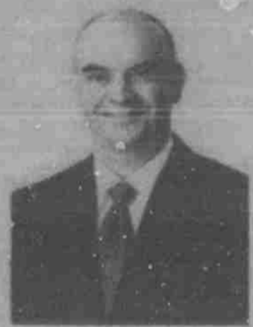
Rick Noriega U.S. Senator