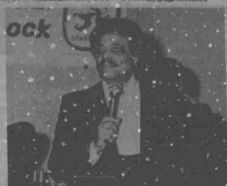
HERE'S TO GOOD FRIENDS — Arthur Prysock, popular singer and the musical voice of Lowenbrau beer, entertains an audience in Columbia, S. C. gathered to honor him for his contributions to music and art. Prysock is a native of South Carolina.