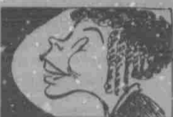
Who is believed to be the first African natural hair-style on national television was worn by Cicely Tyson on CBS' Camera Three in 1969.

Your husband's exhibitionist tendencies can most likely be traced to rejection and the absence of love in his childhood. As hard as it may be to believe, this form of behavior seldom leaps to rape or even child abuse. Although he may outwardly appear stable, strong and macho, he is crying out for attention. He is saying: "please notice me. Am I good enough to be considered a man? My sexual organs are the only male identity symbol." Many people who have a smaller degree of this inadequacy, tend to over-emphasize their sexual characters, or dress and behave in a way that attracts attention to them. Each case must be judged individually.