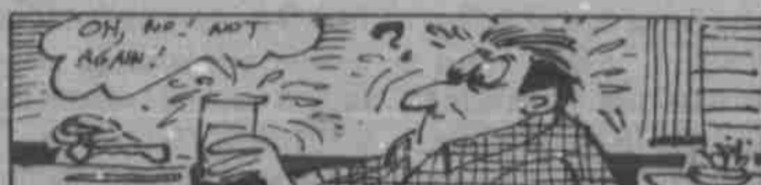
Every glass of water you drink contains molecules of water used countless times before.

We are not West Texas; the South Plains; we are Lubbock! This writer would like to go back to his day at Lubbock Opportunities Industrialization Center (LOIC) as one of the originators and first executive director. It's good to be a part of creating something. Our slogan -- which this writer created -- was: "Let's reach for the moon and figure out later how we will get there later." Lubbock, you have, can have it. Let's figure out how to get there. We can get there!