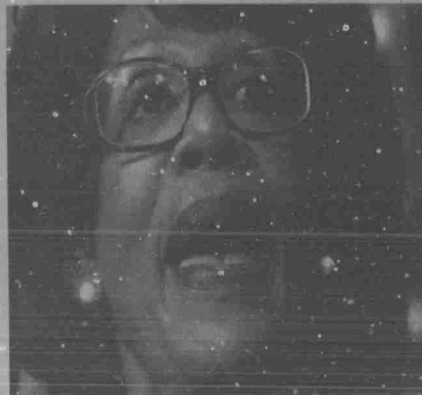
Congresswoman Maxine Waters

Waters's office declined Friday night to comment on her case, and the ethics panel has not