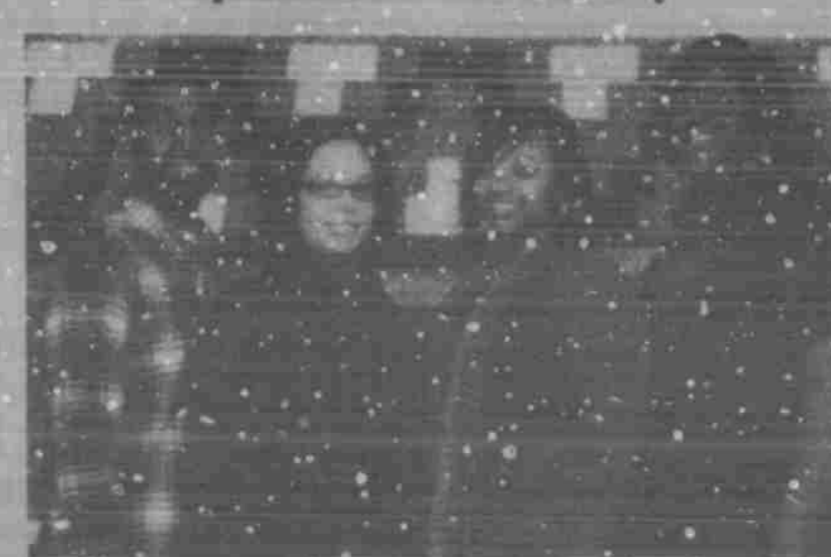
Kings of Kings

Slaton, Texas - The Mt. Olive First Missionary Baptist Church will sponsor its Annual Choir Day on Sunday afternoon, August 8, 2010, beginning at 3:30 p. m.