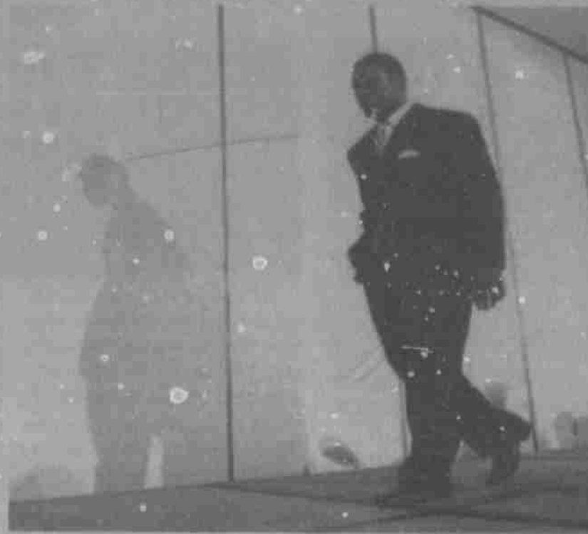
Michael Vick has signed on to work at the Boys and Girls Club, which is a definite step in the right direction. Suspended NFL quarterback Michael Vick is leaving his federally ordered construction job and is working for the Boys & Girls clubs in the Hampton Roads area of Virginia.