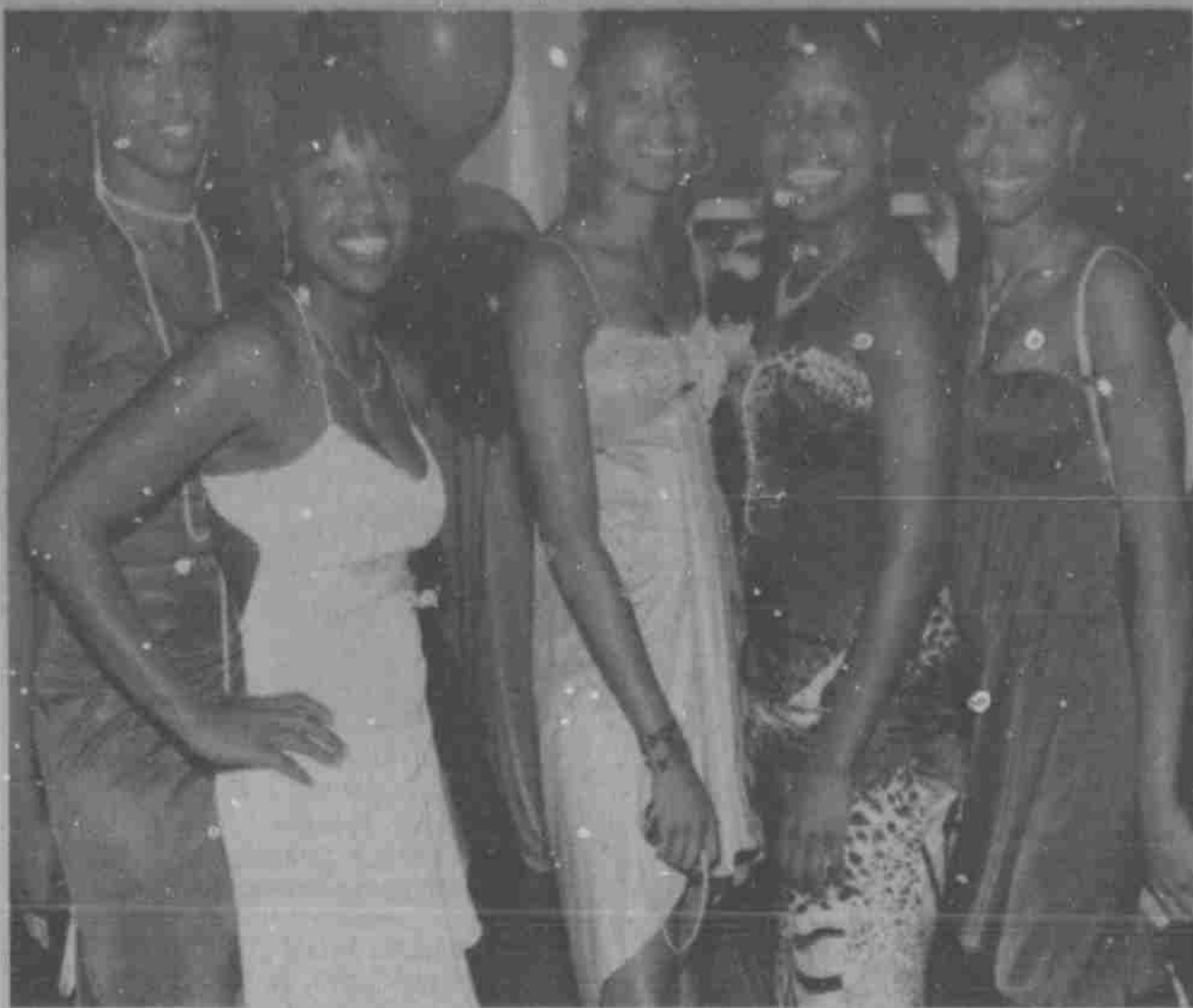
WHO ARE THESE YOUNG ATTRACTIVE BLACK SISTERS? If there is someone who thinks they can identify all of these young ladies, let us hear from you. If you are correct, with all of them then you will receive a FREE subscription to the Southwest Digest. Send your answer to: Attractive Black Sisters, Southwest Digest, P. O. Box 2553, Lubbock, Texas 79408.