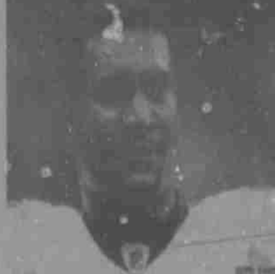
Steve McNair, 36, spent 13 seasons in the NFL, the majority with the Tennessee Titans.

Continued from Page 1 for a local band and a crane operator at U.S. Steel. When he recognized the musical talents of his children, he organized and trained the Jackson 5, also serving as their manager.