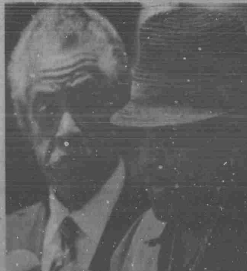
Joe Jackson with family friend at Staples Center

Since Michael Jackson died Thursday of what his family has said was cardiac arrest, his father has been vocal about his son and the posthumous arrangements being made. Medical examiners in Los Angeles are perhaps weeks away from officially determining the cause of death, though a second autopsy has been