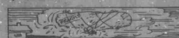
A honeybee can carry a burden 300 times its own weight.