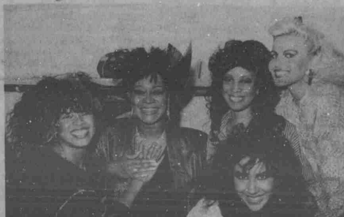
PATTIE AND MARY JANE - Popular songstress Pattie LaBelle and Motown's exciting Mary Jane Girls appear on the "Best of Budweiser Superfest" television special which benefits the United Negro College Fund. The program airs nationally on a syndicated basis and is scheduled by the local station airing the program the week of April 5-11. Also performing on the entertainment spectacular are Kool and the Gang and the O'Jays. The program is hosted by

Budweiser spokesman Lou Rawls. Rawls also hosts the "Lou Rawls Parade of Stars" telethon. The "Best of Budweiser Superfest" kicks off the 1986 Budweiser Superfest concert tour which will visit 15 cities this summer.