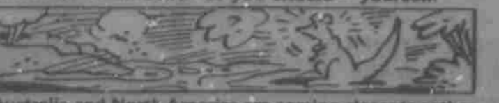
Australia and North America are coming closer together at an annual rate of four-tenths of an inch.

But more than this, I honestly believe that if you haven't read Dianetics there is one subject you don't know as much about as you should - yourself.