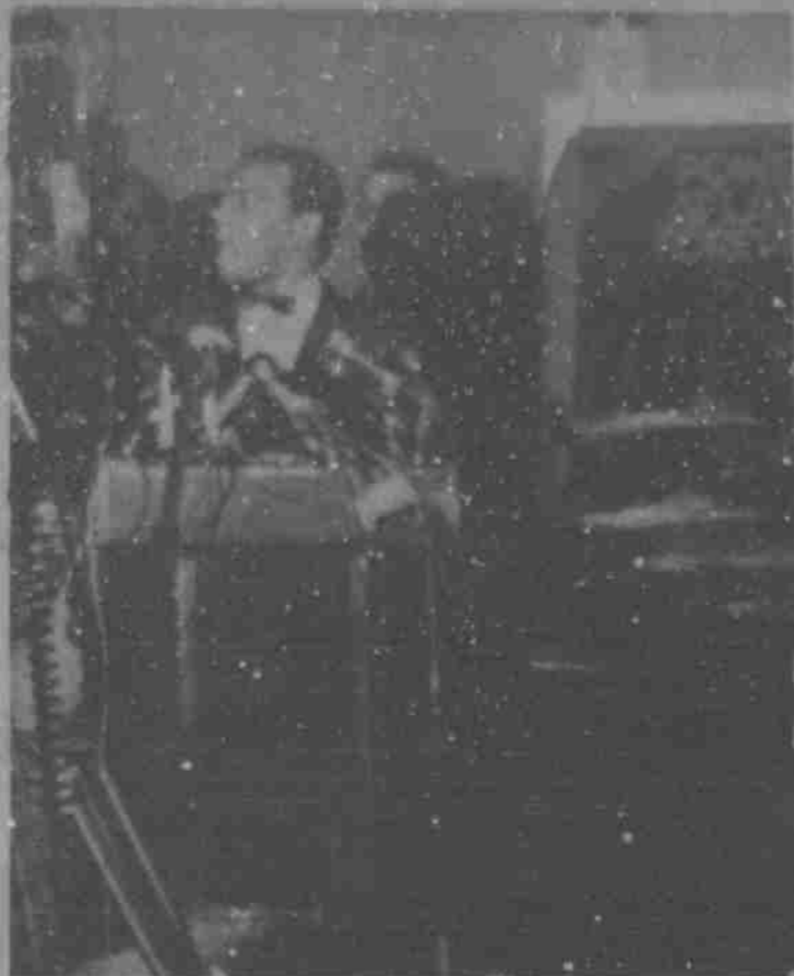
Minister Louis Farrakhan