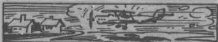
The first licensed woman pilot was Baroness Raymonde de la Roche of France. She received her pilot's license in 1910.

All things are ready, come to the feast. Dinner will be served after the Representatives of their churches will also be here. Young people are especially invited to hear a young 11 year old preacher.