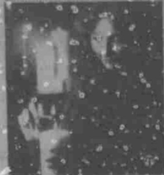
Scented candles in holiday, bayberry and pine are becoming holiday favorites for that special decorative touch.

Light up you. Life this holiday season with the warm glow of candles.