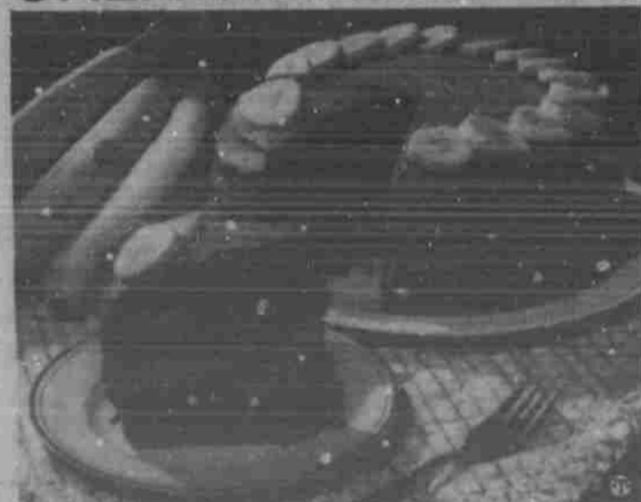
This recipe is simple as can be. We've taken a basic chocolate cake mix and added our own luscious filling of whipped cream, melted chocolate and bananas.