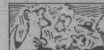
The largest living species of kangaroo stands seven feet tall.

• Before placing a candle on furniture use a pillar pan or other holder. Furniture may be damaged if care is not used.