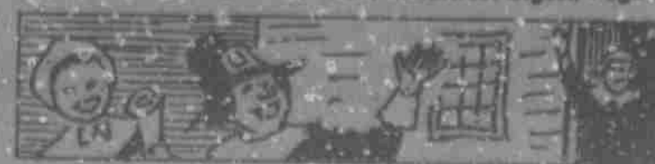
The first black settlers in the U.S. arrived in Virginia as indentured servants before the pilgrims landed in Massachusetts. As indentured servants they became free after seven years.