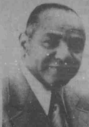
Carl Rowan Newspaper Columnist

When I was choosing a career, a job as a reporter at my local newspaper wasn't an option. Those doors were closed to blacks. Things have changed some, but not enough. There are still too few racial minorities pursuing news careers or being given a chance to: