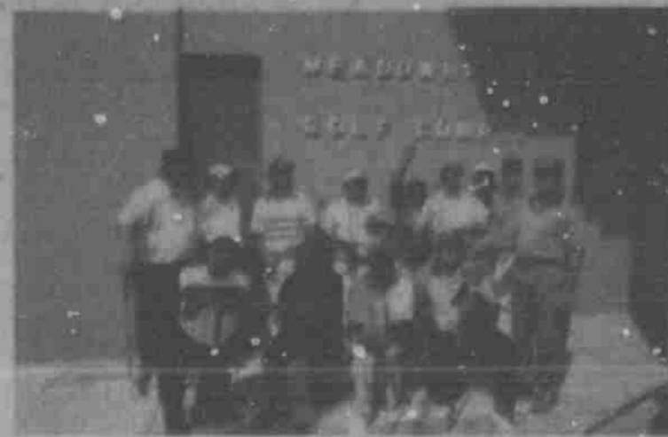
Kango Golf Association Members