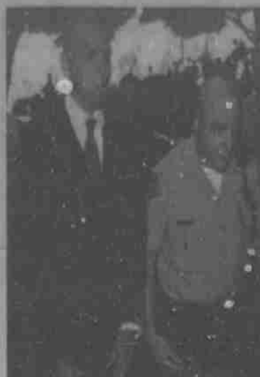
Chris Brown arrives for his sentencing hearing at Los Angeles County Superior Court Tuesday.

LOS ANGELES (AP) — A judge on Tuesday sentenced Chris Brown to five years' probation and six months' community labor for the beating of Rihanna and issued a stern admonition to the R&B singer.