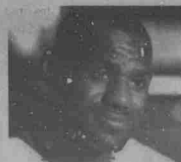
Cleveland Cavaliers star LeBron James sits for an interview in the locker room of his former high school.