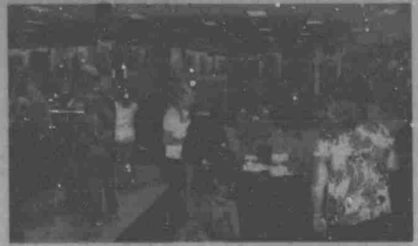
Theodore Phea Boys & Girls Club Members Shopping