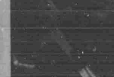
President Barack Obama

Christ Temple is located at 2411 Fir Avenue.