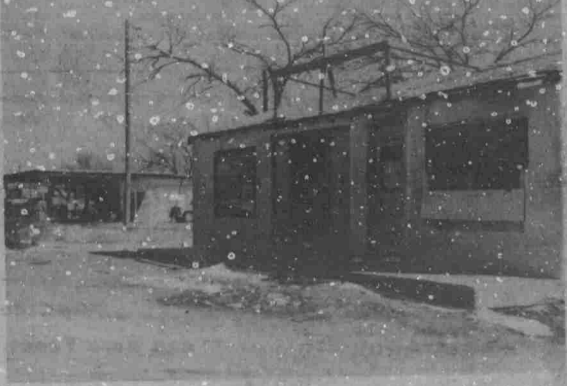
NEEDS CLEANING UP!! Pictured above is an old building which needs to be demolished in our community. This is the kind of a scene we don't need in Lubbock. It would be great if a drive would be initiated to do away with some of these kind of structures which the City of Lubbock hasn't seen. At the same time, let's begin some clean-up campaigns in our various neighborhoods.

VOL. IX, No. 26 PHONE (806) 762-7512 $10 EAST 23RD STREET LUBBOCK, TEXAS MARCH 21 THRU MARCH 27, 1985