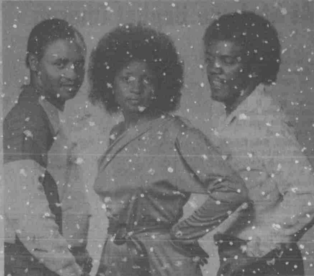
Pictured are members of the Playmates and 15th Street Players who will serve as stage band for the event.