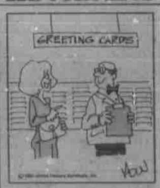
WHAT'S APPROPRIATE FOR RESPONDING TO A WANT AD?