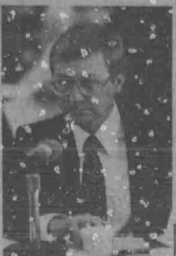
Senator John T. Montford

Senator Montford also commented on the legislative